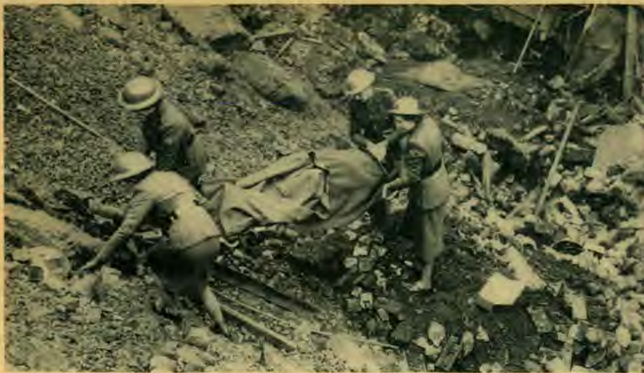
Girls of the American Ambulance Corps of Great Britain making a rescue from a London bomb crater. Their 260 mobile surgical units are always ready for action.

could have saved the world from all its sorrows.