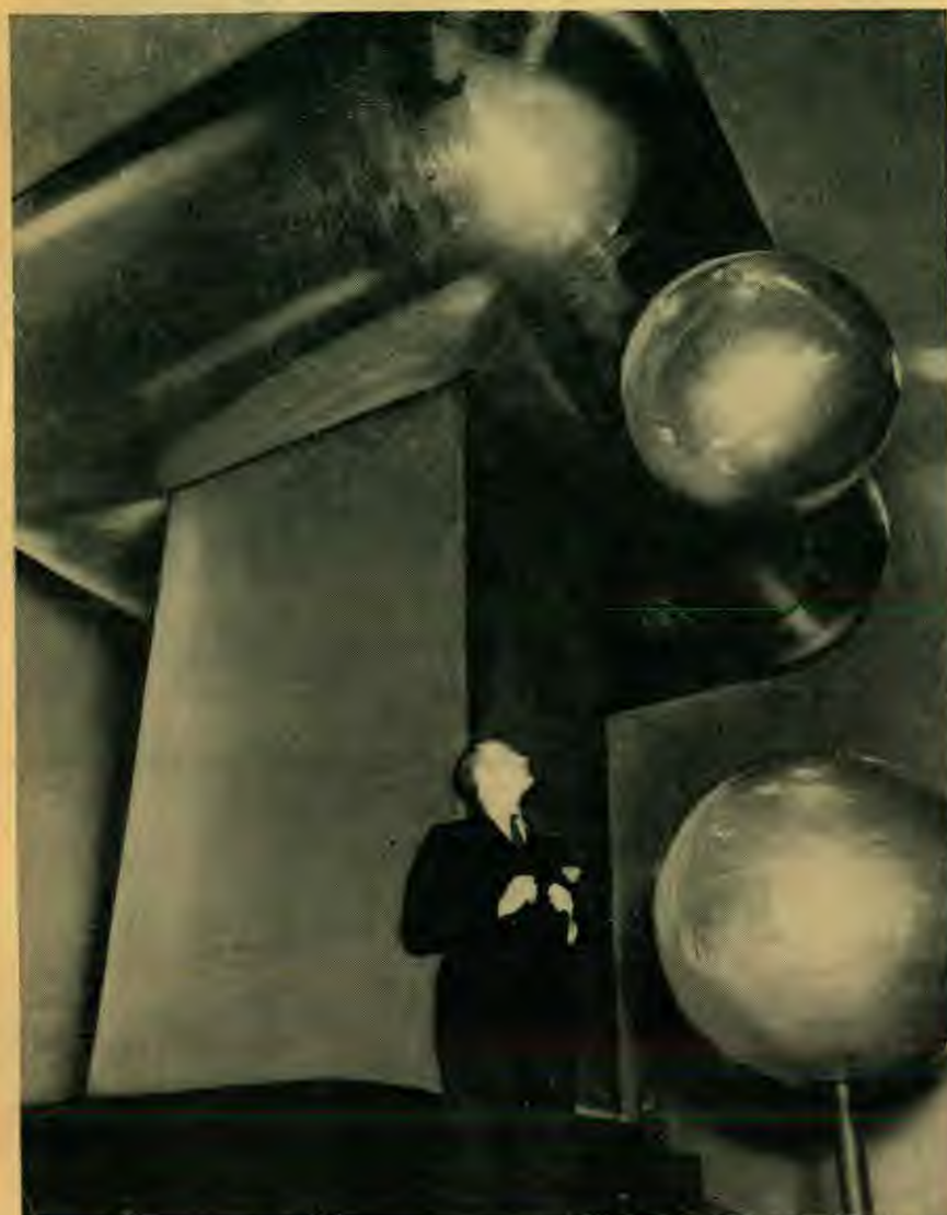
An X-ray machine in the Huntington Memorial Hospital, Boston, which, it is claimed, is four times as powerful in the treatment of cancer as would be all the known radium in the world.