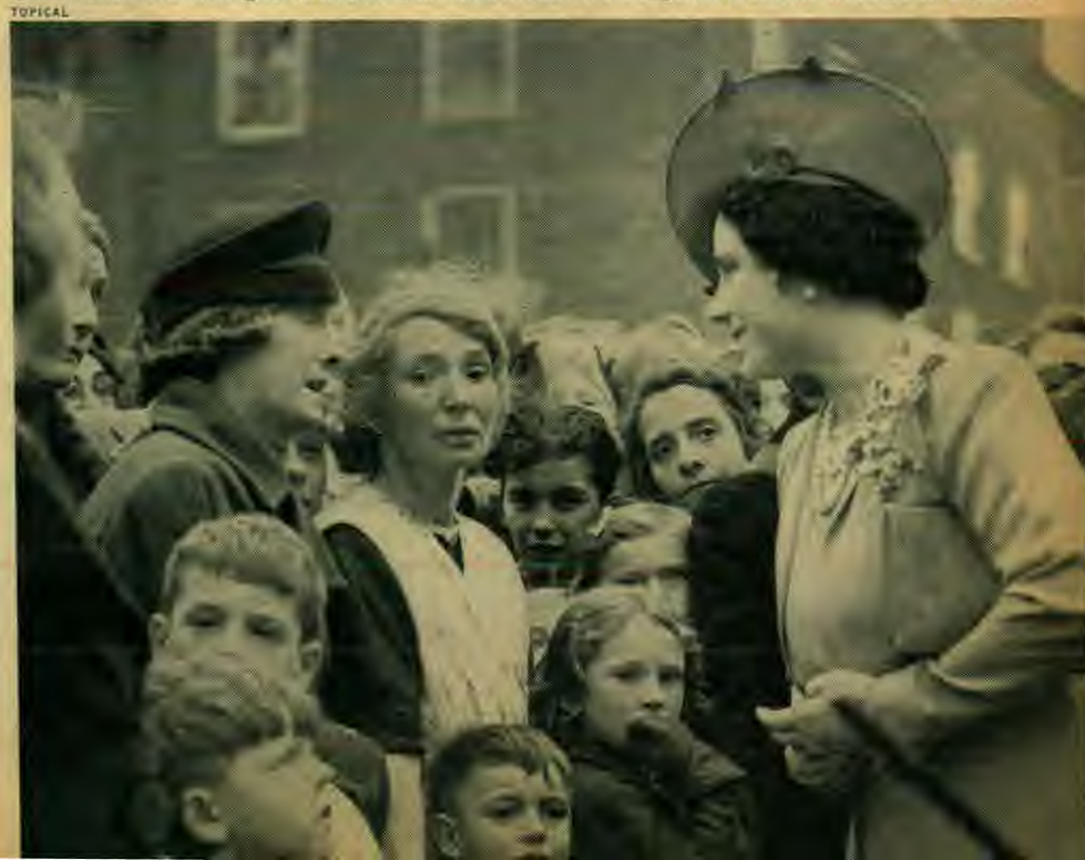
Queen Elizabeth talking with women and children who have suffered in recent air raids on London.