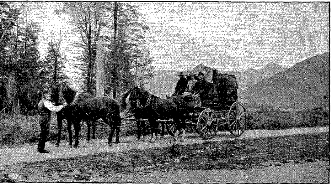
Scenery near Nelson, New Zealand. Kundly loaned by "Australasian Coachbuilder and Wheelwright."

able to give ocular demonstration, both in the field and to a gathering of farmers in the evening, of the cause of the trouble. The results agree with the examination of numerous specimens from other localities, and in every instance the wheat-stem killing, fungus was found blackening the base of the stem. The whole thing now becomes clear. Plants attacked by this fungus succumb at various stages of growth, according to the