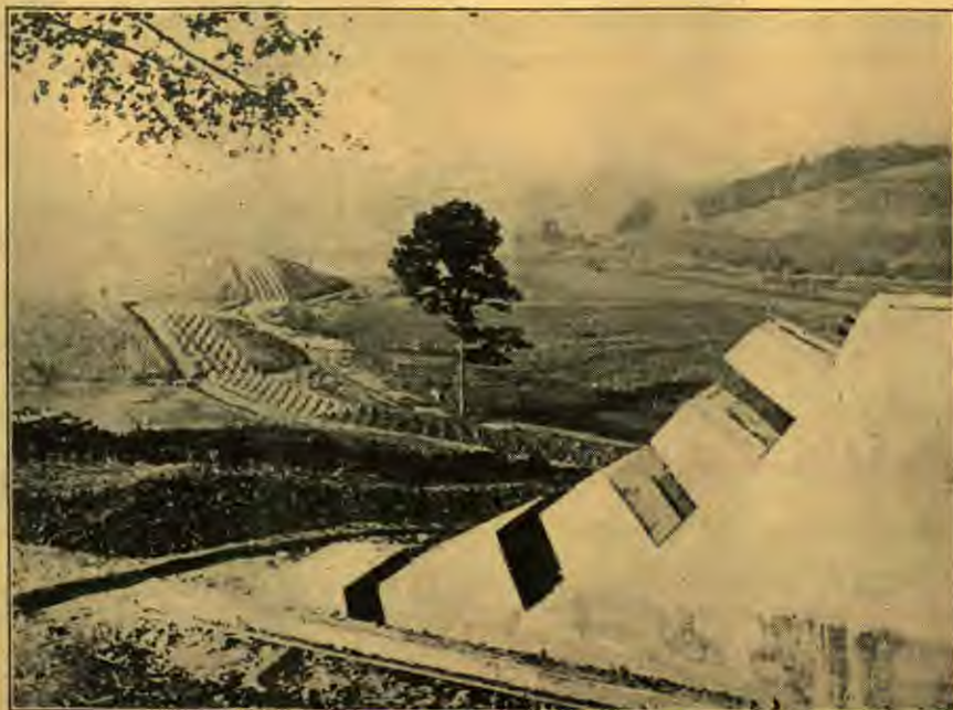
A view of the fortifications against tanks in Germany's strong defence line on the Western front. The giant concrete blocks are designed to tear the tanks' caterpillar wheels. Moved by great fear, the nations today are feverishly building all manner of unprecedentedly strong defences.

A FEW weeks ago there appeared in the Melbourne Argus a report of the new Federal policy for the care of aborigines as evolved by the Minister for the Interior, Mr. McEwen, and adopted by the Federal Cabinet. The object of this policy is "to raise the status of the aborigines to qualify them to accept the privileges and responsibilities of full citizenship." It will provide for their immediate physical needs, their health, and, within the limits of their ability, their education