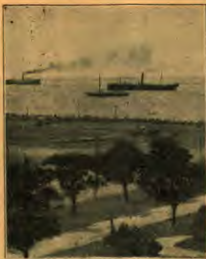
Left: A glimpse of part of the harbour of Manila, the capital of the Philippine Islands. Right: Grass-roofed houses in Northern Luzon, the largest island of the Philippine Group.