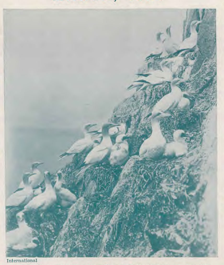
Solan Geese on the Bass Rock, Firth of Forth, Scotland (see page 32)