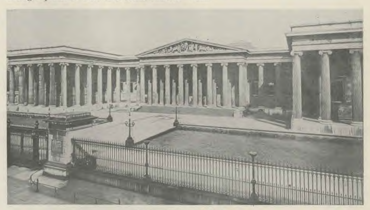
Exterior of the British Museum

art, and music, are among the most sensitive, jealous, and envious of mortals, yet no trace of these fleshly weaknesses is discernible in any of the writers of the Bible,—not one of them reveals in the smallest degree a spirit of rivalry, or of criticism or disparagement of any of the written statements of the others. On the contrary, each of these numerous writers ascribes full divine authority to the declarations of the others, whenever he has occasion to refer to them.