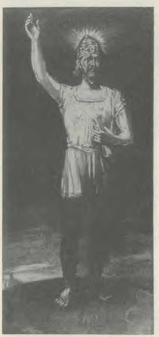
The Great Image

What kingdom is this? It is generally believed to be the Roman Empire. The symbol represented a universal power that should break all that went before it. Rome alone answers this description. History records that her rule was never successfully disputed. In Luke 2:1