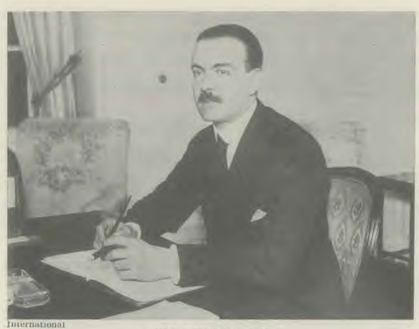
5. Prince Habib Lotfallan