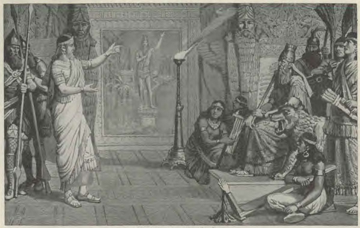
Daniel Interpreting the Dream