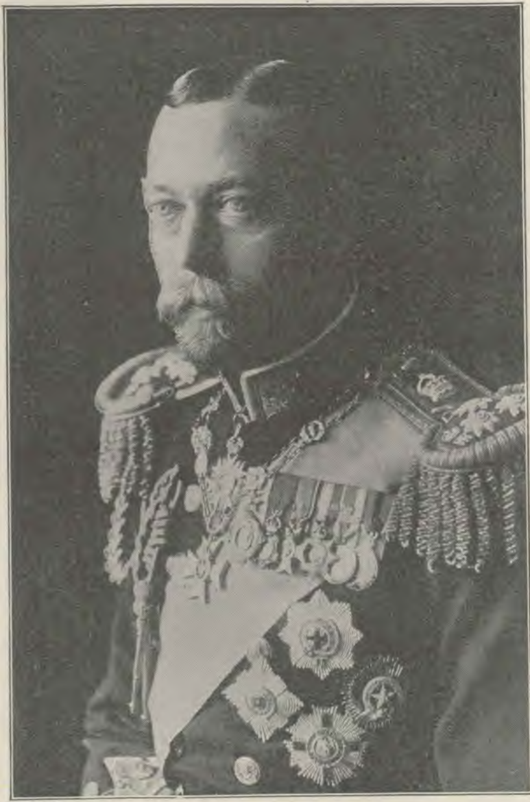
U. & U.

child who was destined to sit on David's throne. Isa. 9:6,7. David also sang of the world-wide dominion of the all-conquering King. Ps. 2:7-9. An angel informed a virgin in Nazareth about fifteen centuries later that her babe