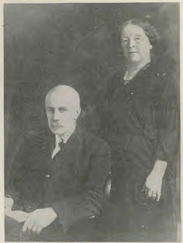
British & Colonial Press