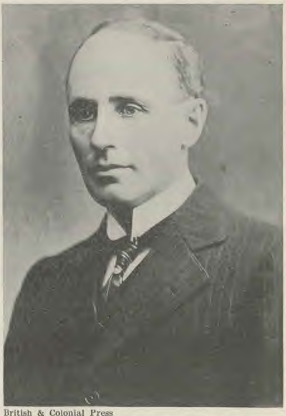
Rt. Hon. Arthur Meighen, Premier of Canada

The readers of the Canadian Watchman will readily agree that the Premier has been blessed with good parents. They are splendid types of Canadian citizenship, of the sturdy pioneer stock that has built up Canada from a struggling colony into a great self-governing nation. And these fond parents have every reason to thank God that after passing "the threescore years and ten" they can in health look upon such a family of children and grandchildren. On retiring from the active labour of life, they will not be censured for a pride that one of the sons they nurtured has risen to the highest place in the gift of the Canadian people; and we are sure that all our readers, regardless of political choice, will join the editor in wishing them continued health, that they may long enjoy a well-earned temporal rest, and when God's time shall come, that they may receive the crown