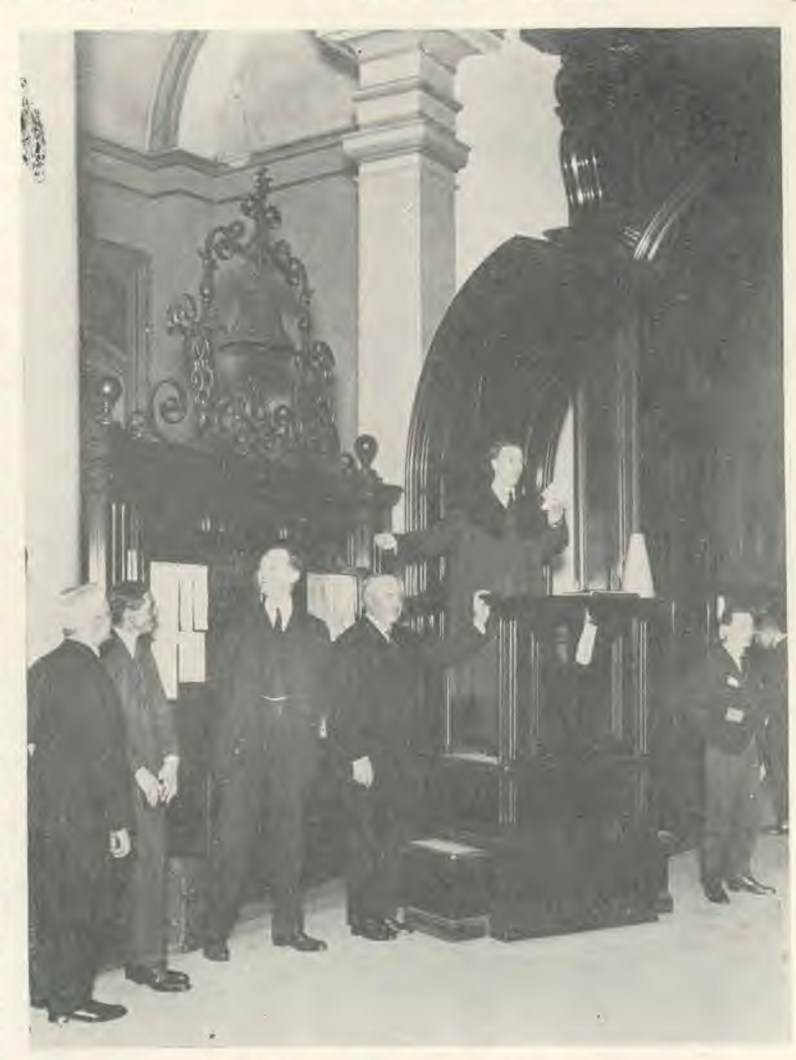
JOY BELL RUNG AT LLOYDS

Recently at Lloyds, London, the famous Lutine Bell was sounded. The crier mounted the pulpit and announced, "Gentlemen, the sailing vessel 'Joan' has arrived at Lisbon." The Lutine Bell is sounded only to convey the news of an overdue ship's arrival at port.