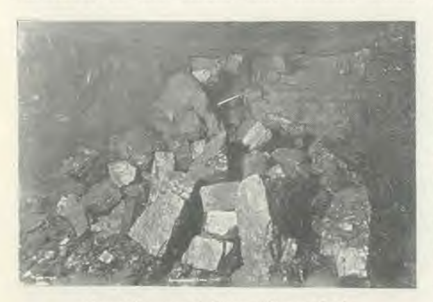
Great Lumps of Clean Alberta Coal

The fossils in some instances are perfectly preserved, which shows that they were subject to some quick action of nature. Great hordes of animals and enormous masses of plants were caught, as it were, in a trap, and were quickly embedded in the strata that contain them.