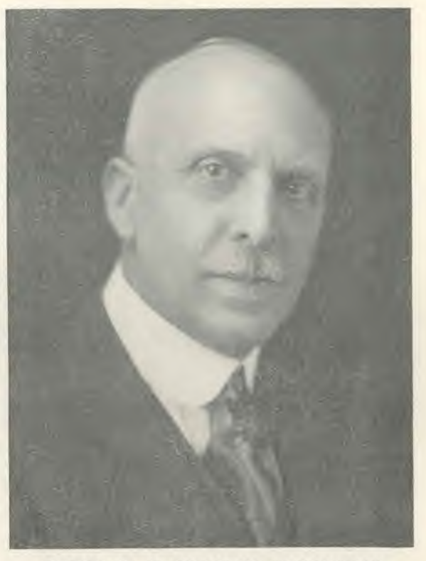
MAYOR W. R. OWEN OF VANCOUVER

It is noticeable that many, if not most, of the radical destructive revolutionists and agitators are childless individuals, both men and women.