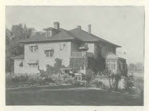
First residence erected on the British Columbia Fruit Lands, near Kamloops, B. C., now one of the finest houses in many miles.

When the defiance of God's law is almost