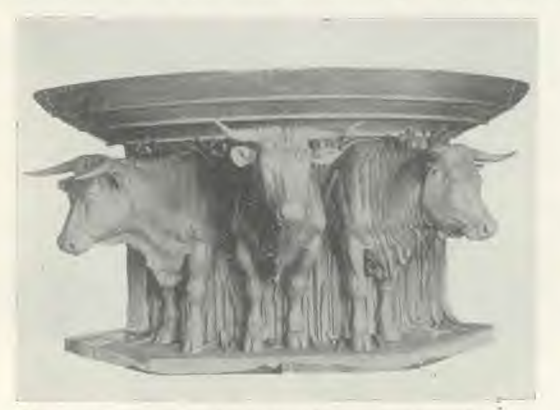
Huge baptismal font in Mormon temple at Cardston, Alta., supported on backs of twelve life-size oxen.

to make void the law of God have upon the righteous? Will they be intimidated by the almost universal scorn that is put upon the law of God? Will the true believers in the "Thus