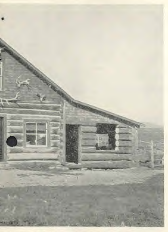
Prince of Wales' ranch, near High River.