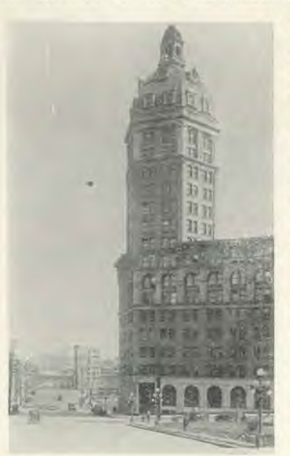
The Tower Building, Vancouver's New City Hall

PERHAPS you will say, "I am tired of hearing about