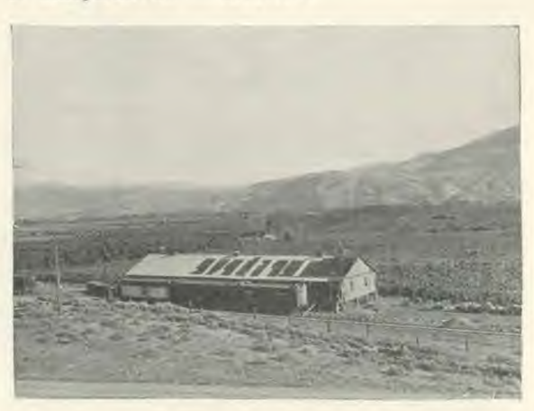
A fruit-packing plant near Kamloops, B. C., built by the co-operation of settlers, formerly officers of the Royal Irish Constabulary.

If he has anything worth while to say, he will get an audience without his conversation being seasoned with profanity. If he hasn't anything worth while to say, the remedy is to get something worth while rather than to attempt to impose upon himself and the public. His seasoning at best is in bad taste, and at worst is blasphemous."—Selected.