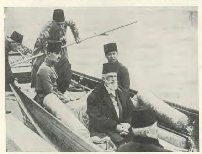
The deposed Caliph in the royal barge in Turkey on his way to attend the divine service of blessing his "holy beard." This service marks the growth of the beard at the right traditional length.

2. Substitute whole-grain bread or bran bread for white bread, and use only whole-grain preparations, such as brown rice. Avoid macaronies and other pastes and the milled cereals that come in cartons. Shredded wheat is whole wheat. Use freely of coarse vegetables and fruits, and avoid concentrated foods, such as cheese.