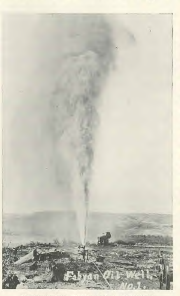
FABYAN OIL WELL, NO. 1, ALBERTA This view was taken last August.

The fact is, there is no such uniformity as geologists would lead us to believe from their unqualified statements. They have had to do much patching of the fragments found in different parts of the world. Moreover. nearly all the innumerable fossils are only partially preserved, only the hard parts-teeth, bones. shells, etc.-remain, and the interpretation of these incomplete remains is difficult and uncertain. Darwin devotes a