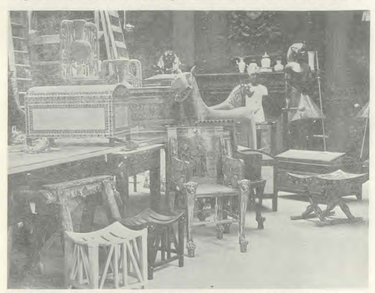
A REPLICA OF OBJECTS FOUND IN TUTANK HAMEN'S TOMB NEAR LUXOR, EGYPT These will be a feature of the British Empire Exhibition at Wembley this summer.

In spite of the decline of faith in the inspiration of the Bible, we are back in the age of astrologers, wizards, spirit communication, psychic philosophy, charms, lucky and unlucky signs, and fortune-tellers. History repeats itself, and the discovery of King Tut's