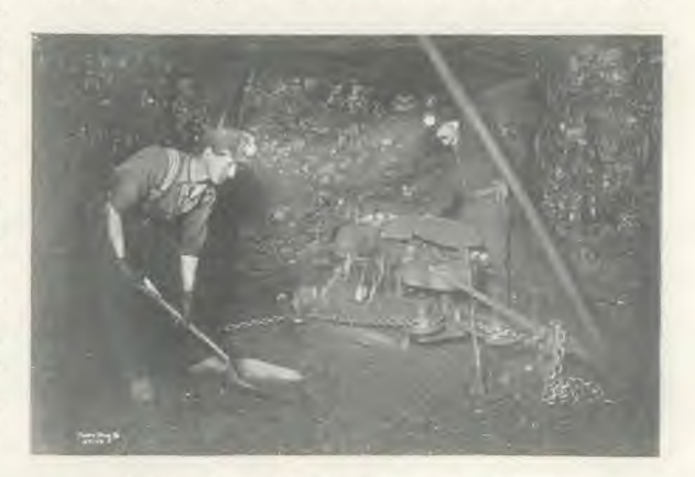
Mining Coal by Machinery in Alberta

The statement from this eminent evolutionist is in perfect accord with the Bible story of creation. If the theory of evolution be true, why cannot fossils be found that show animal life before it was differentiated? The earliest rocks were formed before there was any animal life. Why should not the later rocks contain fossils of the earliest animals, and not simply of animals that were "already