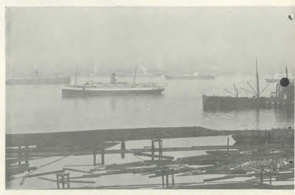
New Ballantyne Pier, Vancouver, B. C. On the day the photograph was taken the