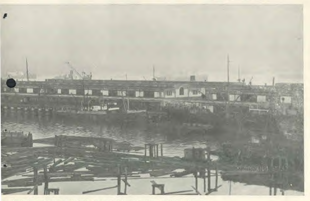
ere forty-four deep-sea vessels in port, in addition to many coastwise steamers.