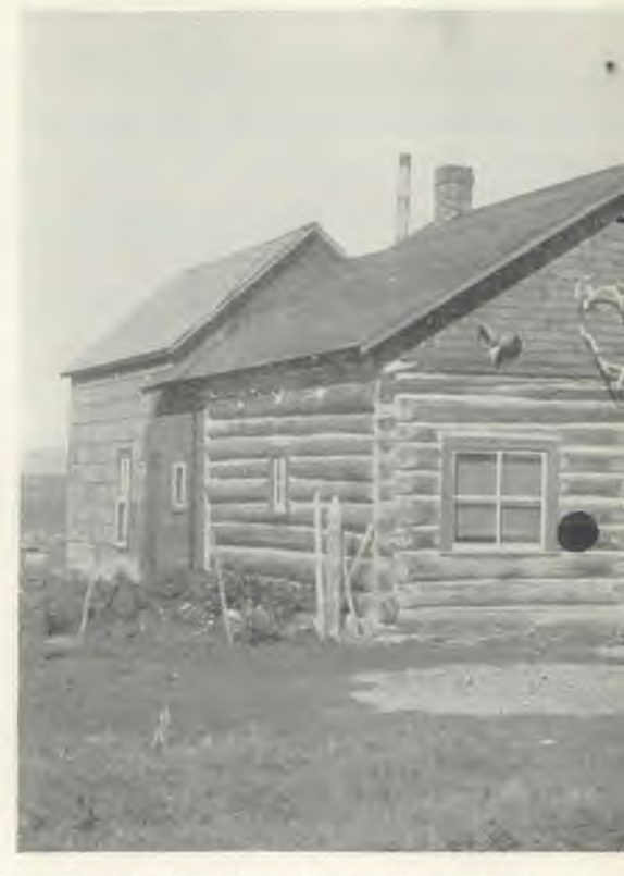
South Fork Trading Post, Alberta; the nearest store to-