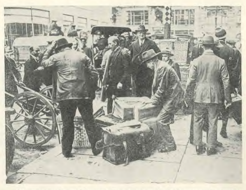
Transporting the weekly pay-roll in paper marks in Germany. The mark is now stabilized at about twenty-two cents per trillion.

Often high blood pressure is without serious symptoms, and the person believes he is in perfect health until he has an examination, as for