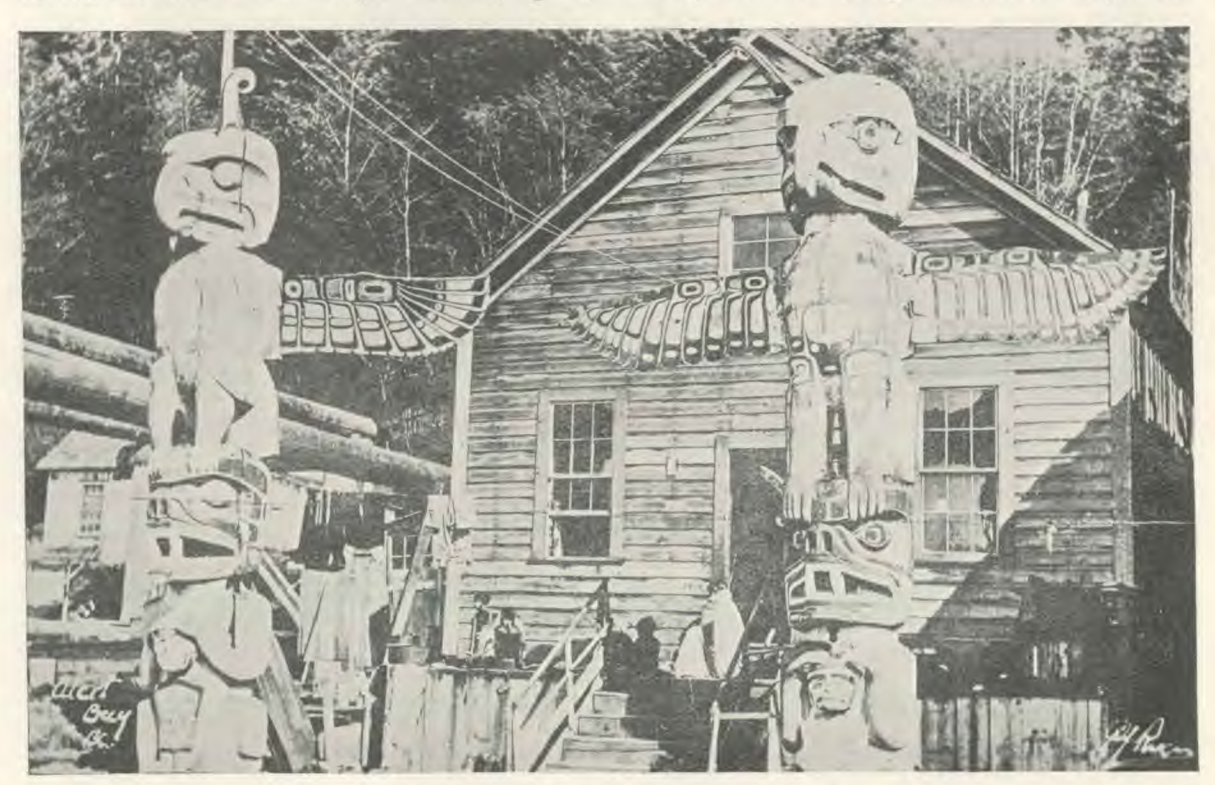
TOTEM POLES AT ALERT BAY, B. C.

Up till October last, the countries that follow the Greek Orthodox Church—Russia, Greece, Serbia, and Rumania—continued to use the Old Style or Julian calendar. There was now—since 1900—a difference of thirteen days between the Julian calendar and the solar year, but the days of the week in the four Orthodox Church countries above mentioned agreed with those in the rest of the world, where the Gregorian or New Style cal-