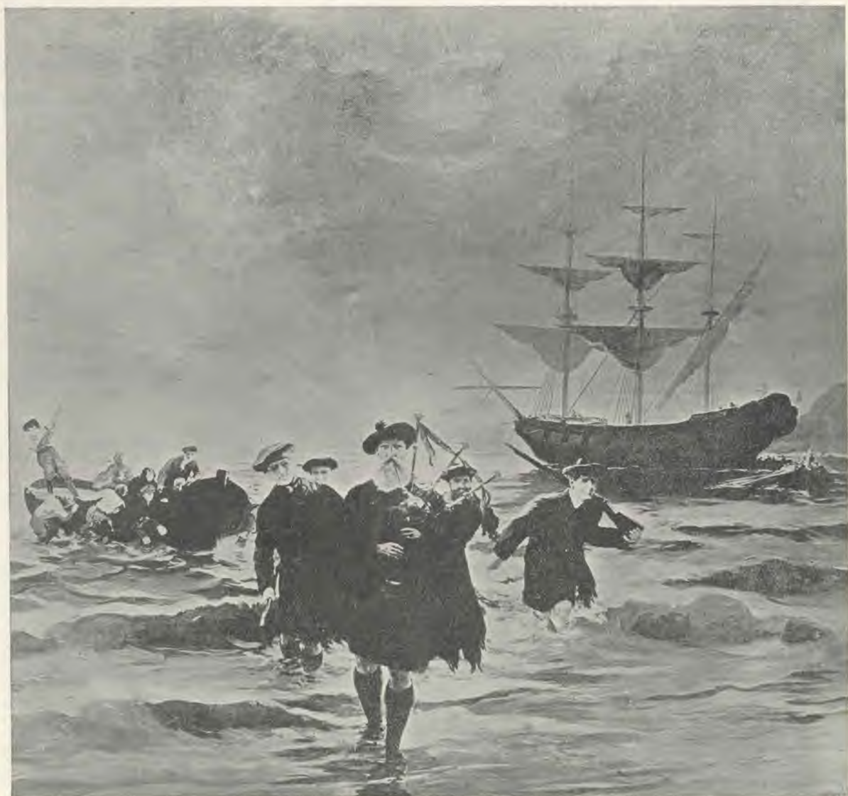
Landing of the Scots in Canada