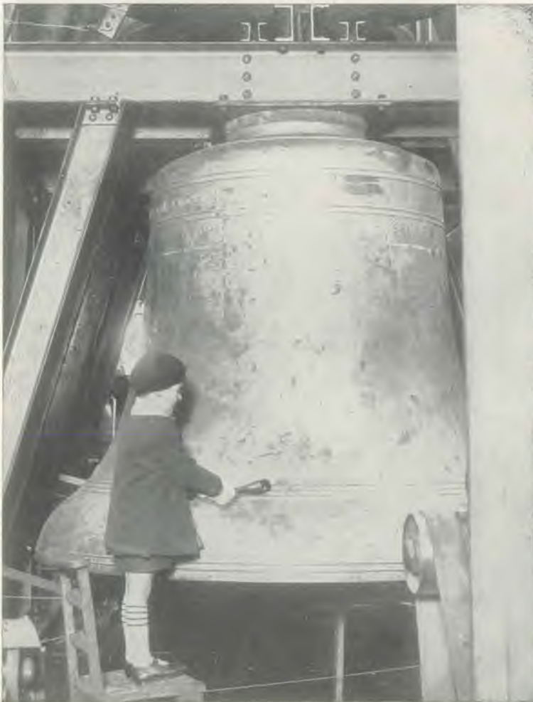
The world's greatest carillon for Victory Tower, Ottawa, is expected to ring out for the first time on July 1. The bells are from the foundries of Gillett and Johnson, Croydon, England. The carillon consists of 53 bells. The photograph shows the largest one, a bass, weighing ten tons. It has an inscription in French and English and a decoration of maple leaves around the top.

Those who were directly instrumental in bringing about the birth of the nation whose sixtieth birthday we celebrate this year are called the Fathers of Confederation. They were of French, English, Scotch, and Irish descent and represented both of the great political parties in Canada. The story of how it has come to pass that there are two nations in North America, both predominantly English in language, both drawing their political ideals of representative government from Great Britain, one British and the other completely separated politically from the mother country, is intensely interesting, but too long to be rehearsed in detail here. For over one hundred years Canada and the United States have lived side by side in peace; and the prospects of either war or political union between them is now too remote for serious consideration. At the time of the American Revolution in 1776 the French in Lower Canada (Quebec) refused to join in the rebellion against England. They had no particular love for the Americans with whom they had warred for one hundred years; and under the Treaty of Paris they were guaranteed religious freedom and self-government under the British flag. So they turned a deaf ear to the revolutionists. They had no interest in the quarrel.