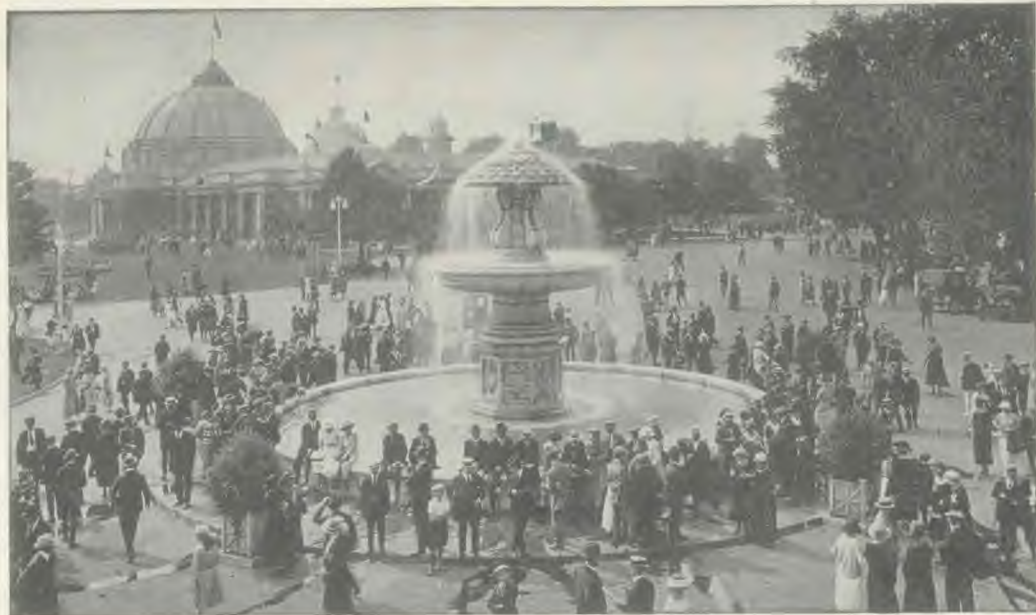
Possibly the world's most famous meeting place, Gooderham Fountain at the Canadian National Exhibition.