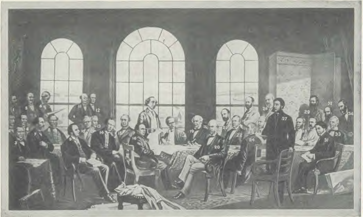
FORMATION OF THE DOMINION OF CANADA, 1st July, 1867. Statesmen who inaugurated the Union of British Provinces in North America.