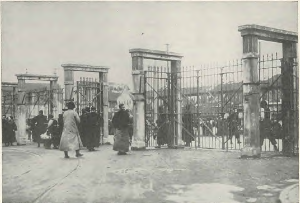
This picture shows the barricades separating the French concession in Shanghai, China, from the native city. It was through one of these gates that a Chinese mob tried to force an entrance. It may not be that the mob correctly reflected Chinese sentiment, but there is no doubt that the presence of British, French, American and Japanese soldiers is all that saved foreigners in Shanghai from wholesale slaughter.

(1) Every true minister of God preaches the message that God gives. Never has God left it to man to choose his own message. God's minister neither