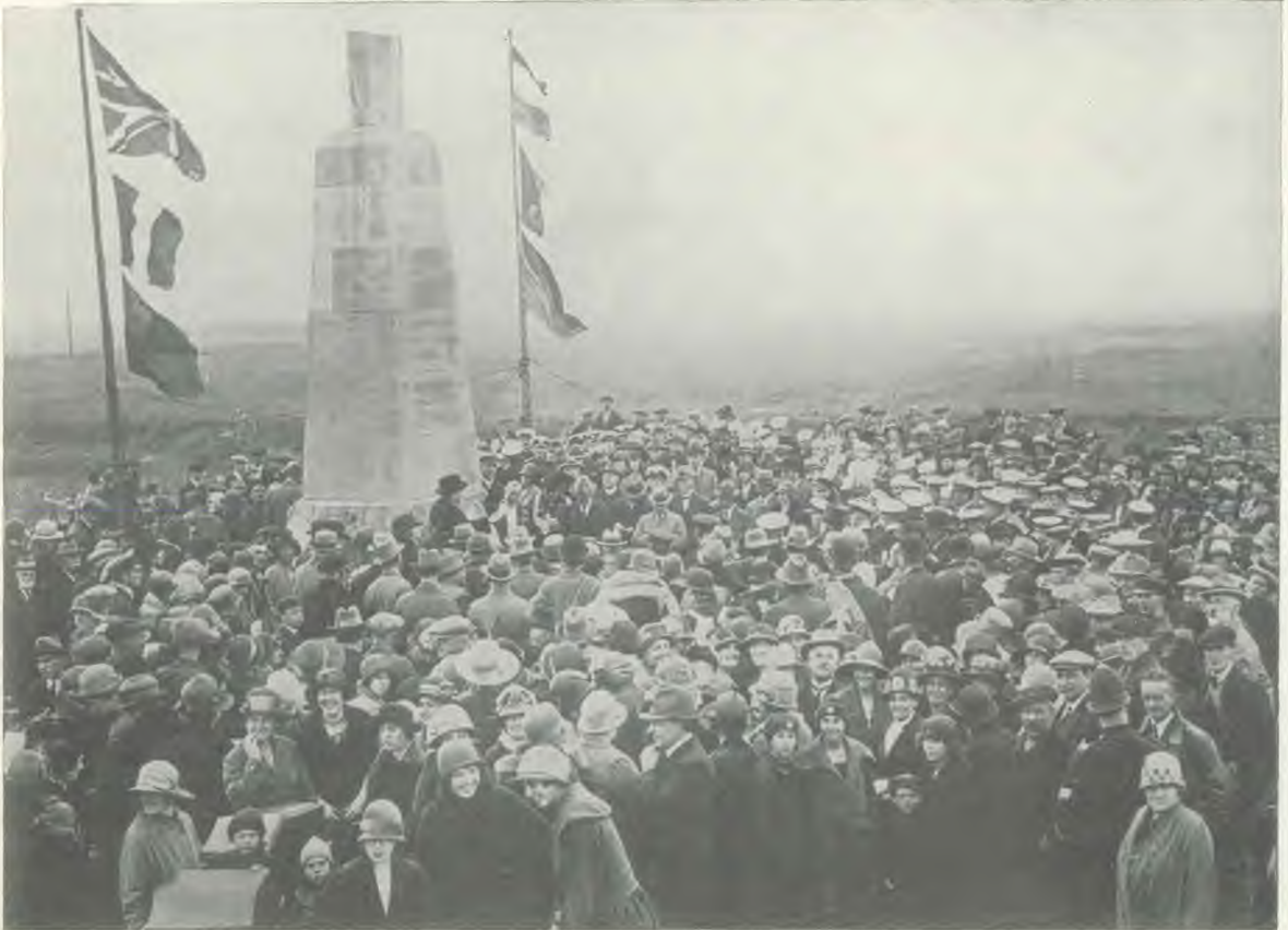
ANGLO-AMERICAN TRIBUTE TO THE PILGRIM FATHERS

be gathered all nations: and He shall separate them one from another, as a shepherd divideth his sheep from the goats: And He shall set the sheep on His right hand, but the goats on the left. Then shall the King say unto them on His right hand, Come, ye blessed of My Father, inherit the kingdom prepared for you from the foundation of the world: For I was an hungred, and ye gave Me meat: I was thirsty, and ye gave Me drink: I was a stranger, and ye took Me in: naked, and ye clothed Me: I was sick, and ye visited Me: I was in prison, and ye came unto Me. Then shall the righteous answer Him, saying, Lord, when saw we Thee an hungred, and fed Thee? or thirsty, and gave Thee drink? When saw we Thee a stranger, and took Thee in? or naked, and clothed Thee? Or when saw we Thee sick, or in prison, and came unto Thee? And the King shall answer and say unto them, Verily I say unto you, Inasmuch as ye have done it unto one of the least of these My brethren, ye have done it unto Me. Then shall He say also unto them on the left hand, Depart from Me, ye cursed, into everlasting fire, prepared for the devil and his angels: For I was an hungred, and ye gave Me no meat: I was thirsty, and ye gave Me no drink: I was a stranger, and ye took Me not in: naked, and ye