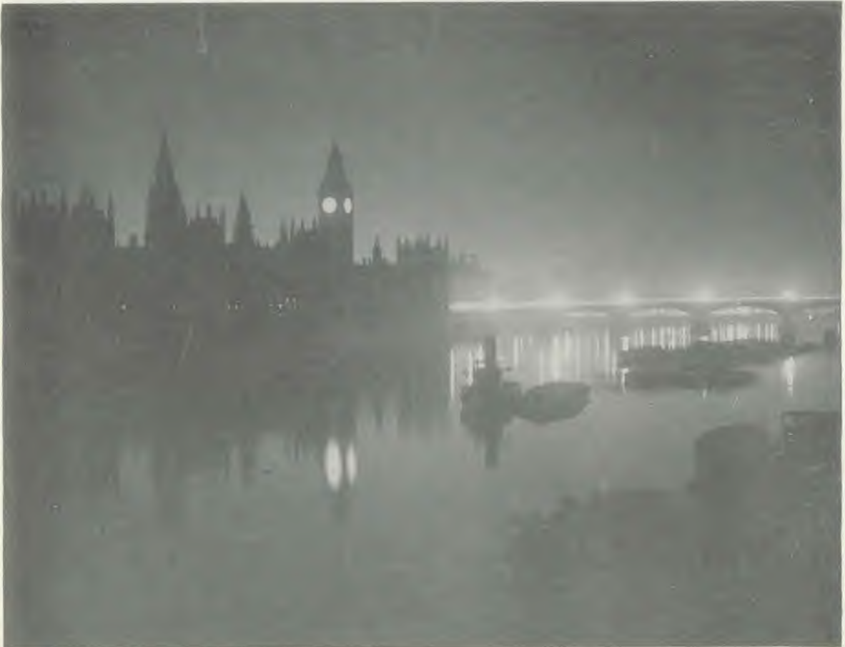
London by night. Tours around London by night are very popular with the visitors from abroad, particularly Canadians, who are thus enabled to see the great city from an entirely new aspect. The picture shows a view across the river Thames, with Westminster Bridge, the Houses of Parliament and Big Ben.