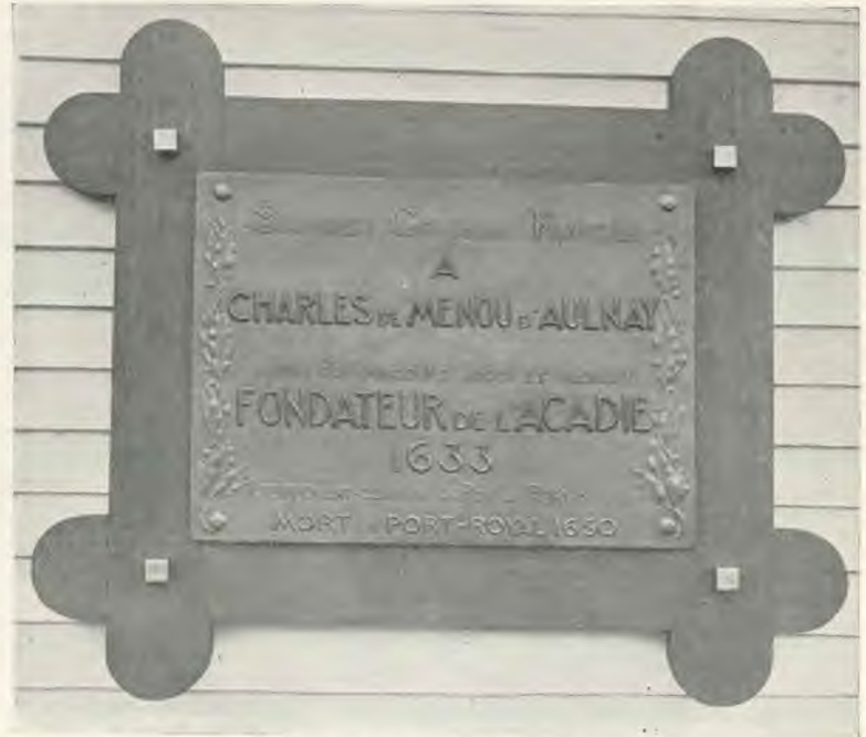
Bronze tablet, mounted on teakwood, placed on the officers' quarters building in Fort Anne, Annapolis Royal. It was a gift to the fort from a society in France which is engaged in perpetuating the memory of French pioneers in various parts of the world.