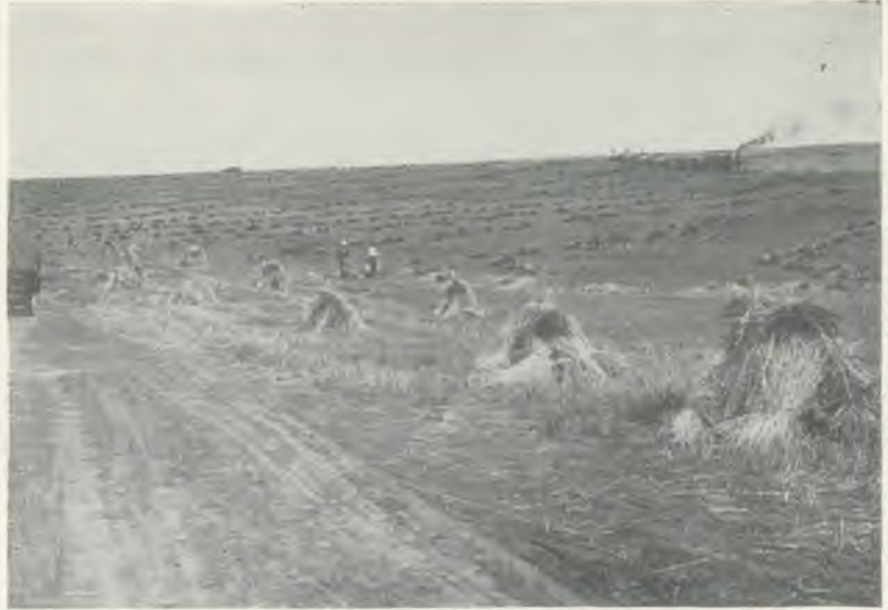
God said, "Behold, I have given you every herb bearing seed, which is upon the face of all the earth, and every tree, in the which is the fruit of a tree yielding seed; to you it shall be for meat." "Thou shalt eat the herb of the field." Gen. 1:29; 3:18.