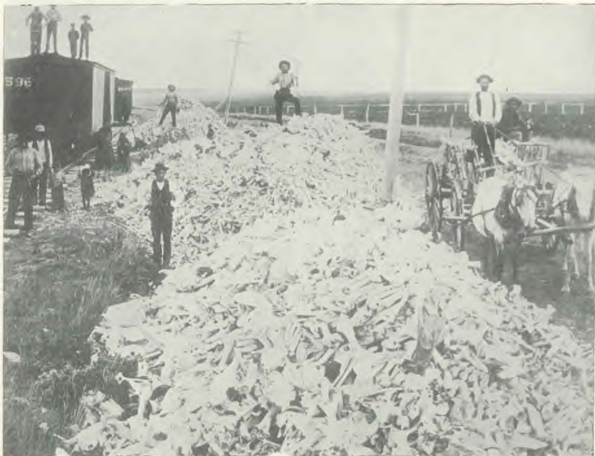
Buffalo bones from the prairies formed the first shipment that the C. P. R. brought eastward.

"No greater achievement has marked the prog-