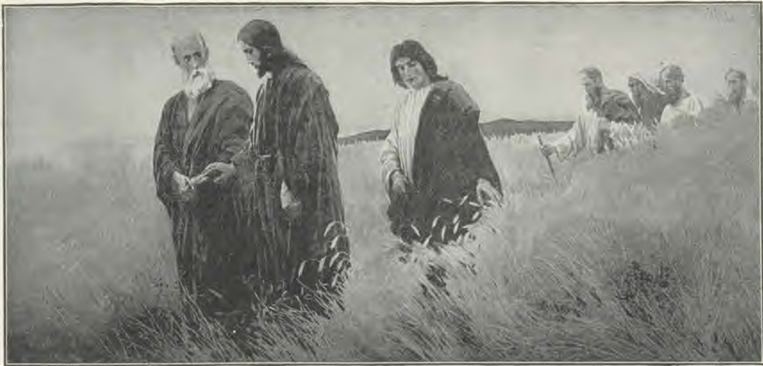
"One Sabbath day, as the Saviour and His disciples returned from the place of worship, they passed through a field of ripening grain."

heaven, and that are in earth, visible and invisible— all things were created by Him , and for Him: and He is before all things, and by Him all things consist." Col. 1:12-17.