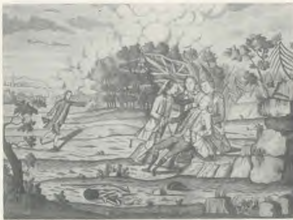
THE DEATH OF WOLFE From an old etching in the Dominion archives.