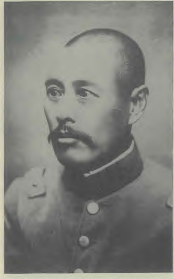
Above. CHINA'S WARRING GENERALS

The situation in China is complicated for the Western powers by the fact that there is no actual government, and several different war lords with large armies are battling for control. The picture shows General Wurfel-Fu, whose name was prominent in Associated Press dispatches some time ago.