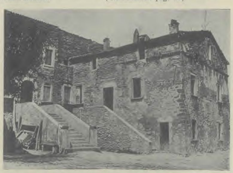
This old stone structure erected more than three centuries ago in Prodapplo, Italy, was the birthplace of Mussolini.