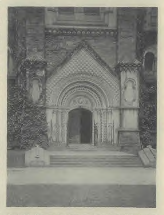
Beautiful Norman doorway of University College, the original building of the first group of Toronto University buildings, completed in 1859.

It was only about four hundred and fifty years after the flood (half a lifetime of those long-lived