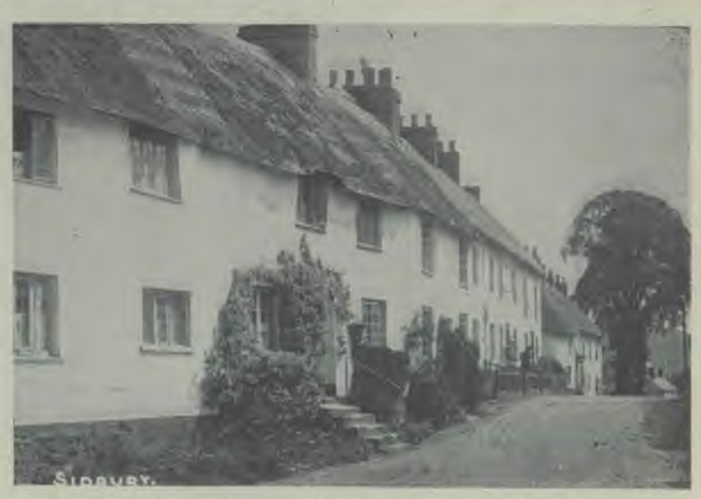
Sidbury, Devon, England. A little glimpse of quaint unspoiled England of long ago.

The Christian is able to understand that the Father above is not the author of the suffering and depressing conditions that are found in the world of today. The earth is groaning because "of the transgression thereof" that is "heavy upon it." There will come a time when sickness and sorrow and the abnormal shall be done away, in an earth made new. Never again shall sin be permitted to enter the world.