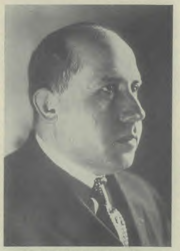
NEW FACTS AS TO LEPROSY Dr. Rodolfo Robles, the famous Guatemalian scientist, whose discovery of pseudo-leprosy will undoubtedly save thousands from stigma of "world Isolation."

The prophet Isaiah tells of a time when a message will go to the professed people of God, saying, Take your feet off my Sabbath and stop trampling it underfoot. (Isa. 58:13, 14.) Our Baptist friends are not the only ones who are troubled about the popular drift of modern theological teaching. There is a growing body of uneasiness in all denominations that the old