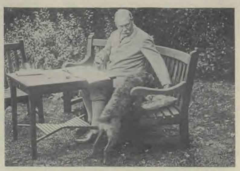
A snapshot of Sir Arthur Conan Doyle, famous writer and investigator of Spiritualism, taken in the garden of his home in Bignell Wood. His home is a real forest retreat equipped with all modern conveniences but burled deep in the wilds to insure him the seclusion that he seeks in literary labour.

In Isa. 26:19-21 we have a very plain testimony touching the resurrection: "Thy dead men shall live, together with my dead body shall they arise. Awake and sing, ye that dwell in dust: for thy dew is as the dew of herbs, and the earth shall cast out the dead. Come, My people, enter thou into thy chambers, and shut thy doors about thee: hide thyself as it were for a little moment, until the indignation be overpast. For, behold, the Lord cometh out of