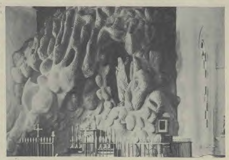
LOURDES OF LOUISIANA

He gave me the impression of being momentarily