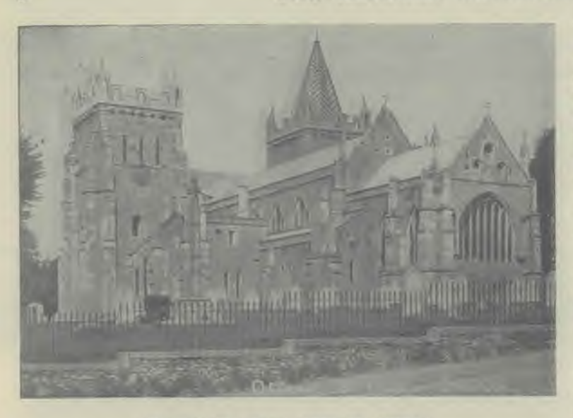
OTTERY ST. MARY CHURCH, DEVON