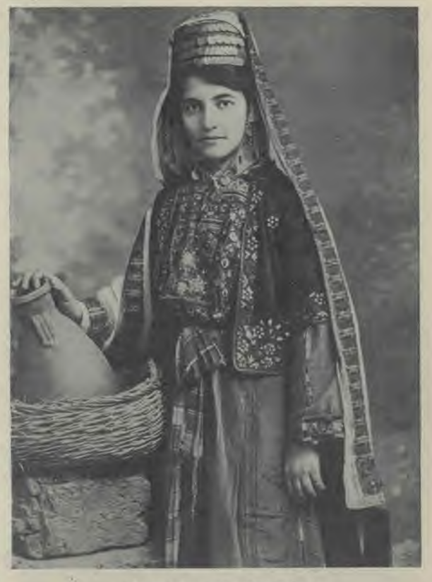
"I WANT TO FORGET"

This may be accepted as a fair statement. But to one who accepts this view there is no place for a "God in direct intellectual communication with man, able to respond to man's desires and under certain conditions willing to do so." And further