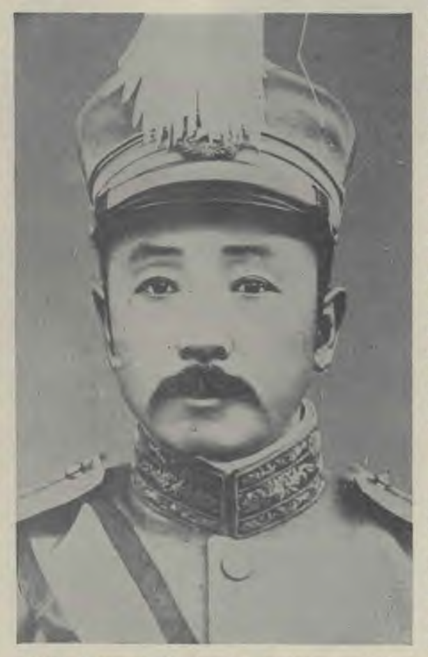
General Chang Tso-Lin, Manchurian dictator and head of the Northern forces in China's distracting and devastating civil war.

With all their wonderful history and heritage, the Chinese are somehow a people of puzzle and paradox. Someone has remarked that "China assays high-grade ore when it comes to brains." The young men and women of old Cathay give place to none in intellectual attainment; and among those who attend our universities are frequently found students of passionate genius and brilliant scholarship. Why, then, should China seem so backward a nation? Again, the land of the yellow dragon is a colossus in area and population, yet weak in power; in natural resources it possesses fabulous wealth, yet is miserably impoverished; countless millions of her people are industrious, yet pitiably desti-