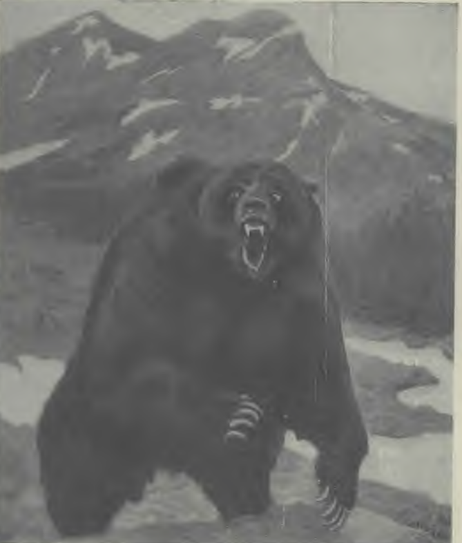
Close-up camera view of a grizzly bear,

It appears, therefore, that those whom God foreknew, He predestinated,—He chose them before the foundation of the world,—they are His elect. Surely this will be a question of vital interest if we can determine with certainty who these people are. Some one may declare at once that God foreknew every living person, and of course in a certain sense this is true, but not in the sense in which the word is used here. This we know because the scripture