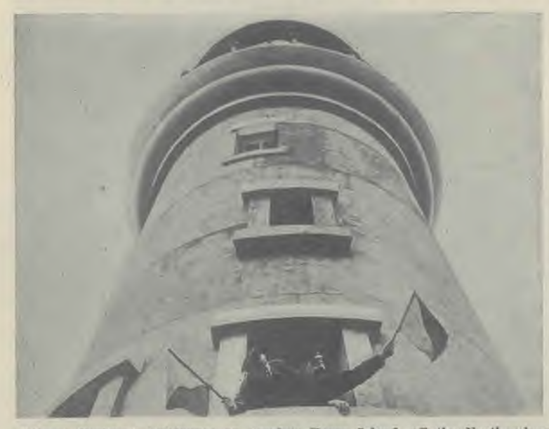
"Grace Darling" lighthouse on desolate Farne Island, off the Northumber-land coast, England. The keepers are shown signalling to the crew of the relief boat, which reached the island in the face of storm and heavy seas, after the lighthouse had been isolated for more than a month. land

The Greek word here translated hell is Gehenna. It comes from the Hebrew Hinnom, a valley south of Jerusalem, called also Tophet. This was the "city dump," where fires were always kept burning.