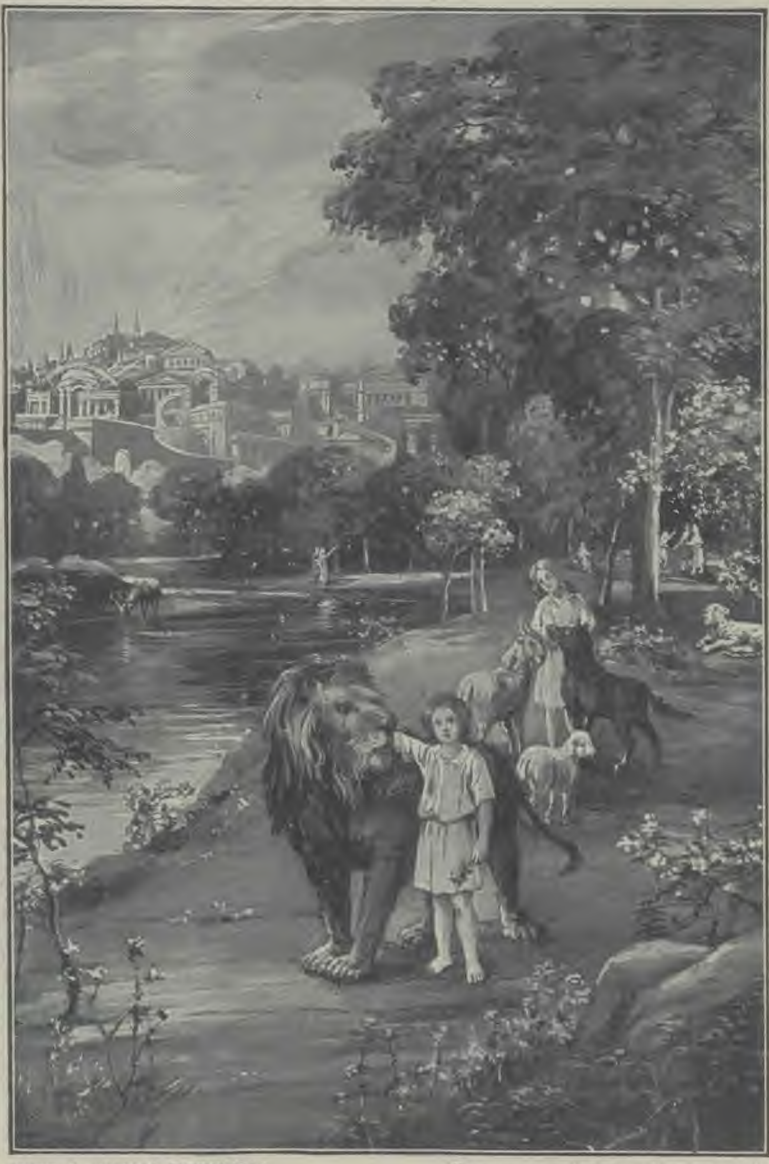
THE SAINTS' ETERNAL HOME

Christ's coming means release from the fear of death. When the Deliverer comes, "there shall be no more death." Rev. 21:4. In that blissful reign of Christ in the new earth, we shall witness no more tearful eyes, no more heaving breasts, no more open graves, no more yawning cemeteries. The fear of death and disease will for ever be banished from every heart. Death itself will be destroyed, and life, abounding and everlasting, will fill the