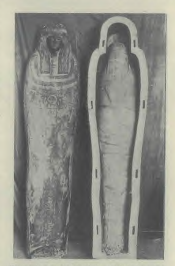
Mummy in a good state of preservation of a priest of Luxor, Egypt, who may have lived in the day of Moses. The ancient Egyptians believed in re-incarnation and carefully preserved the bodies of their dead in preparation for the return of the son'. As one result the world's museums are filled with mummies. The doctrine of natural immortality of the soul lays the foundation for many grievous errors both ancient and modern.

"Let the floods clap their hands: let the hills be joyful together." "Let the field be joyful, and all that is therein: then shall all the trees of the wood rejoice before the Lord; for He cometh to judge the earth: with righteousness shall he judge the world, and the people with equity." Ps. 98: 8; 96: 12, 13.