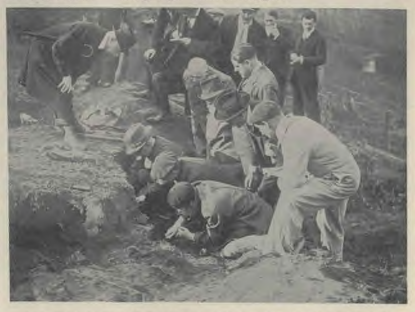
Scientists digging at Glazel, France. Still searching for the missing link.

A statement issued by one of the Bible Societies indicates an annual distribution of thirty million copies of the Bible, or eighty thousand a day, in nearly eight hundred tongues.