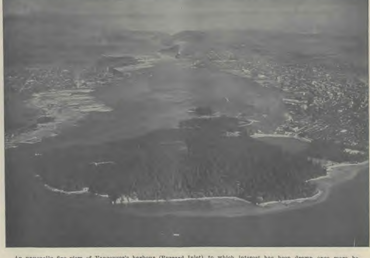
An unusually fine view of Vancouver's harbour (Burrard Inlet) to which interest has been drawn once more because of its new record for grain export. The growing popularity of the western grain route is indicated by the fact that this season's export to date totals 46,564,492 bushels. This, with the 8,000,000 bushels in elevators or en route, will exceed the previous best mark by more than 2,000,000 bushels. This aerial photograph shows Stanley Park in the foreground with North Vancouver's booming grounds and docks on the left and Vancouver's great plers on the right.

The voice of Canada speaks with human frailty to the civilized nations, the words of a thousand tongues, "Peace, peace, and no war." The voice of Jesus speaks to every human soul to lay the all-oppressive burdens of sin and sorrow on Him there to find true peace and rest. Not until, in the words of His Excellency, "the Empire's full strength" has grown into this individual perfectness, can we expect never to be disappointed by the sudden roll of the drums of war.