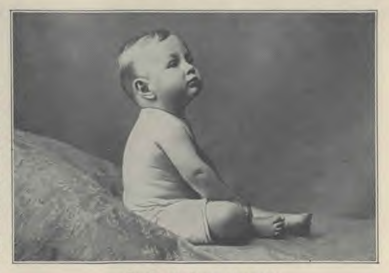
Guard well those tender years.

The vital statistics that show the death rates of babies in various countries are a good index of the degree of the health intelligence or health ignorance prevailing in those countries. For example: In large sections of China, where there is little or no knowledge of health or hygiene, the baby death rate is 525 per thousand; while in New Zealand, where the Plunkett system provides nurse instruction to