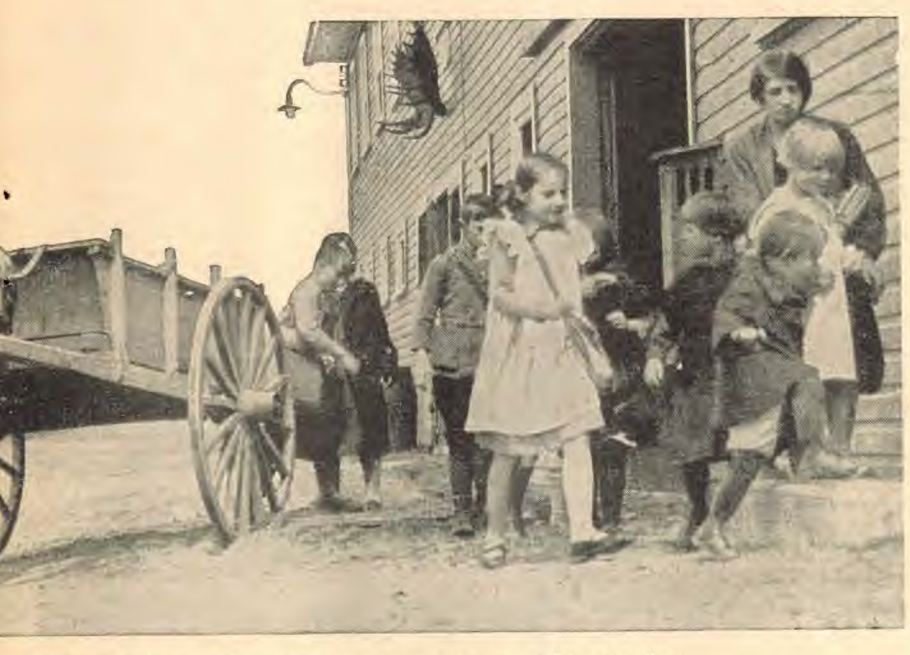
venience of this modern age has come to us within the last be a strange world if we could turn the hands of the clock back

end" his writings and all the great Bible prophecies would be unfolded and disseminated widely over the earth. For this purpose, knowledge would be increased, and many would run to and fro.