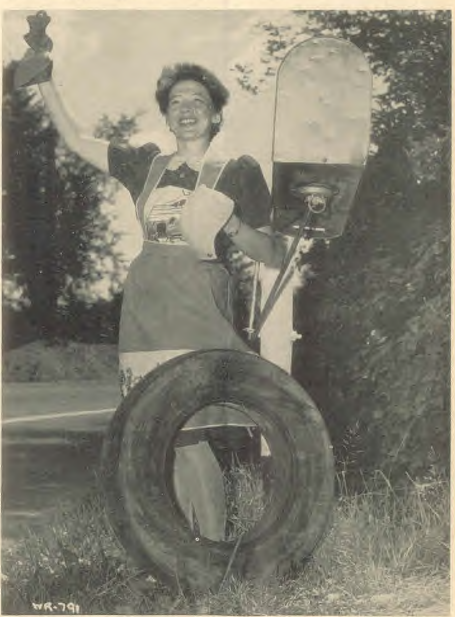
Rural mail carriers are now picking up salvage material in Canada.