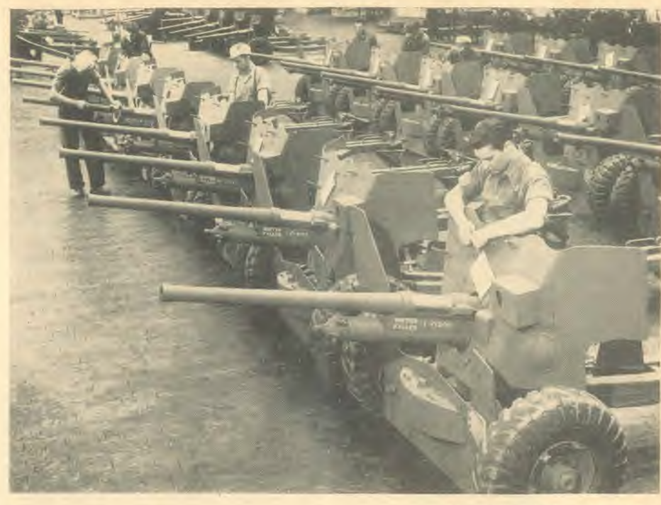
Department Public Information

3. Make your personal plans secondary to national needs. There is one thing that war ought to do for us, and that is to help us realize that there are many other vital matters besides our own personal problems, business, or pleasures. Too often we have been accustomed to excuse ourselves