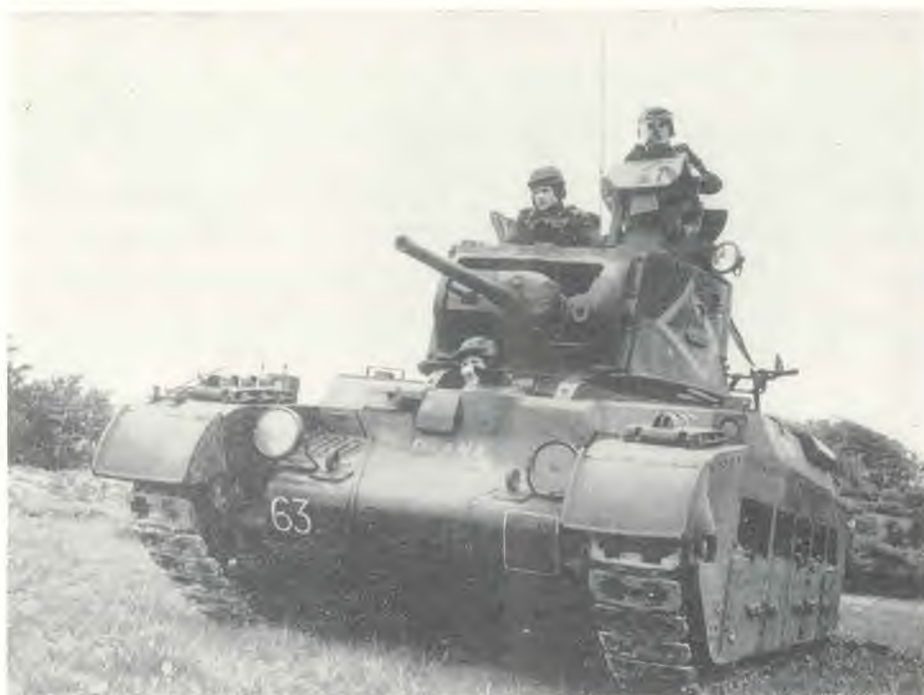
Director of Public Information

● Some men and nations have ambitions to rule the world. This right is being disputed on the battlefields of the world to-day.