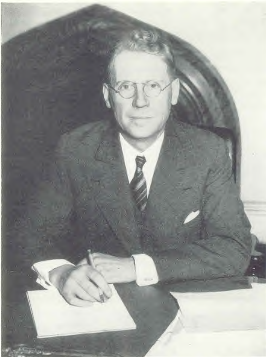
Director of Public Information

● Honourable J. L. Ilsley, Finance Minister for Canada. He bears heavy responsibilities in these trying times, and deserves the support of every citizen of the Dominion.