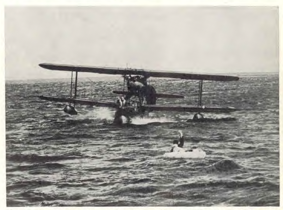
A Spitfire plane of the Sea Rescue Squadron spied this baled-out pilot, and directed this Walrus seaplane to his rescue. One squadron has saved 177 men from the sea.

However, with very insignificant exceptions, the non-Catholic world does