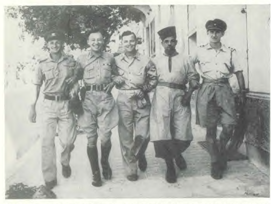
United Nations. From left, South Africa, China, United States, France, Britain. Victory assured, and peace in the offing.

Readers, let us take God into this peace business; or better, let Him take us into it. He's the only heart-changer. The sign of the cross must come before the sign of the V. Then we shall see "victory marching before God, peace following in His footsteps." Psalm 85:13, Moffatt.