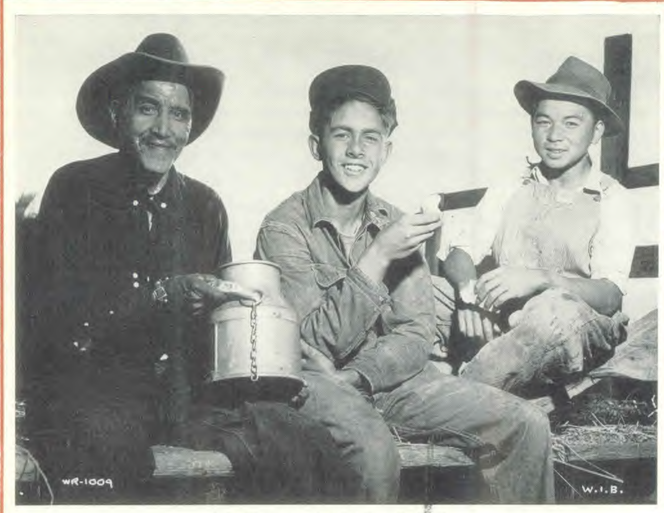
Difference of race does not separate friends.