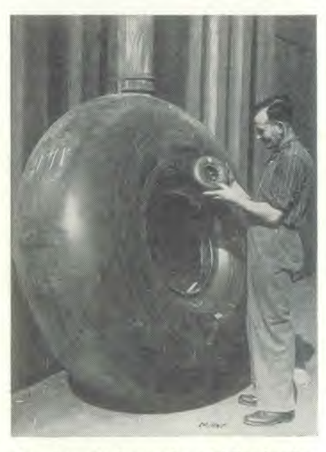
Tires, from the largest for a Stirling bomber, to the smallest tail wheel for a fighter, cushion the landings after the fight.

secretly, democracy falls down. A great degree of government by decree is necessary: in stronger terms, dictatorship. That is why democracy as an ideal form of government is questioned by European and Asiatic nations. If it can't stand strains of war, is it best in time of peace? Should we fight to maintain a government that does not fit us to fight? In fact, almost any form of rule would work if men were not selfish, and no form will