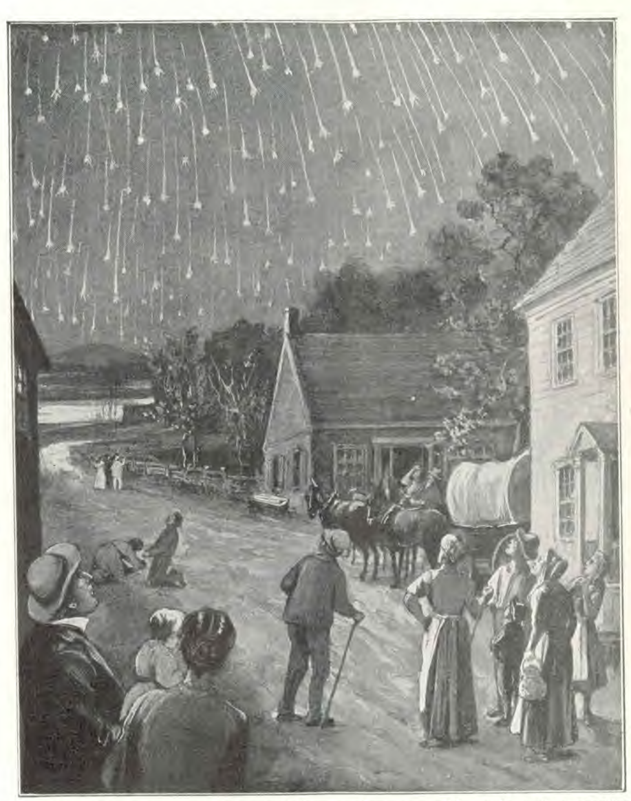
The meteors tell as numerous as snowflakes on that memorable night, and a prophecy centuries old was graphically fulfilled.

To form some idea of the phenomenon, the reader may imagine a constant succession of fireballs, resembling skyrockets, radiating from a point in the heavens near the zenith, and following the arch of the sky towards the horizon. They proceeded to various distances from the radiating point, leaving after them a vivid streak of light, and usually exploded before they disappeared. The