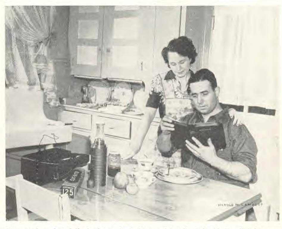
More precious than daily food are the Scriptures that tell of the binding link between God and His people, the Sabbath.

"The Sabbath was made for man" the very next day after man was made. Man was given an occupation for pleasure, for the healthful exercise of body and mind, to dress and keep the Garden of Eden.