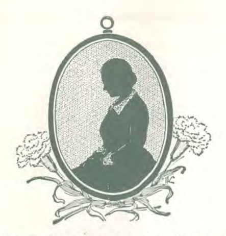
Mother love lies enshrined in the hearts of all of us as the deepest and most self-sacrificing of human love, but divine love transcends even this.

disfigured veterans of World War I were being cared for.