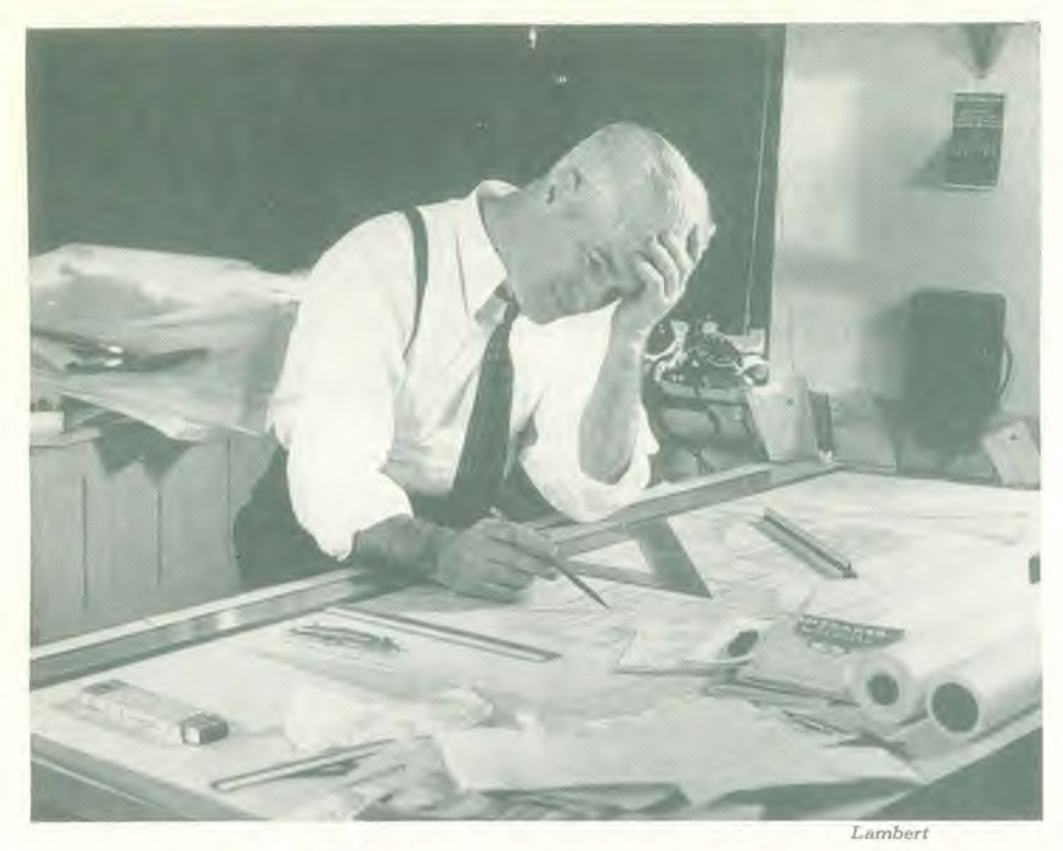
The mind is a tyrant over the body of the ambitious man, and often drives it to ill health.