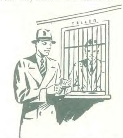
Financial worries belong at the bank, not at the dinner table or in bed.

Our habitual thoughts and emotions may have their counterpart in far-reaching, well-beaten nervous pathways which, when they become "conditioned reflexes",