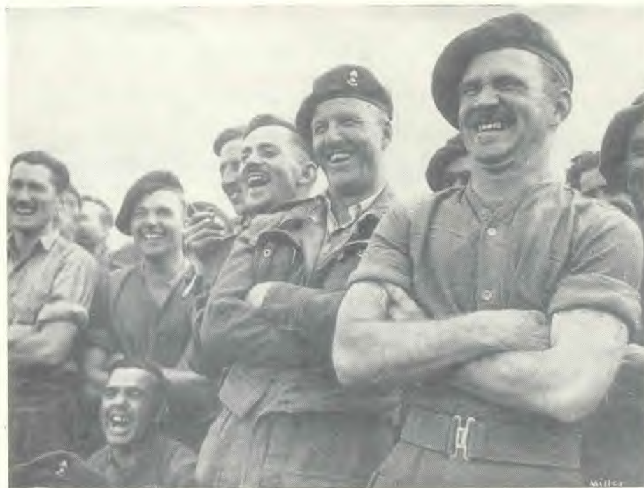
British soldiers can still laugh.

like the Philistines, and they please themselves in the children of strangers." Isaiah 2:6.