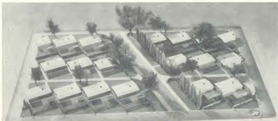
Model of an ideal housing unit of the future, the world of to-morrow. God promises much more beautiful homes for His world of to-morrow.

In Psalms 104:30 we are told that following the resurrection of the righteous the Lord will renew "the face of the earth." Only the face or surface of the earth has been marred by sin. In Isaiah 51:3 it is stated that when the face of the earth is restored even the wilderness will be "like Eden" and the "desert like the garden of the Lord", and that "joy and gladness shall be found therein, thanksgiving, and the voice of melody."