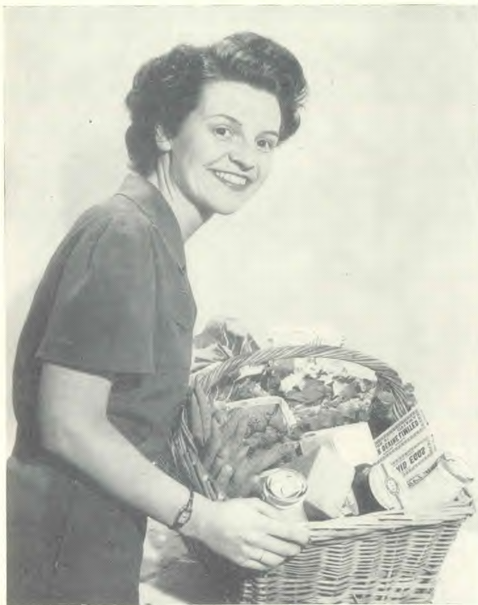
Milk, eggs, cheese, cereals, green vegetables, and fruits will provide the necessary vitamins and minerals to help prevent and cure tuberculosis.

H AVE you been bothered by a persistent cough for some time? Are you eating your normal amount of food and you still continue to lose weight? If so, don't wait, but go to-day and see a physician without fail.