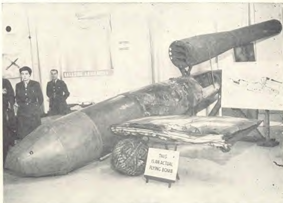
They staged a flying bomb exhibition in London, to show them the weapon of their destruction and how to deal with it.

Now here comes Rufus Jones, a most estimable leader of social uplift and charitable action among the Quakers, with an article in the Friends Intelligencer on Mahatma Ghandi. He praises this "great soul" Indian, and holds him up for emulation by Christians. Thomas Carlyle is quoted with approval in saying that such a man as Gandhi is a mes-