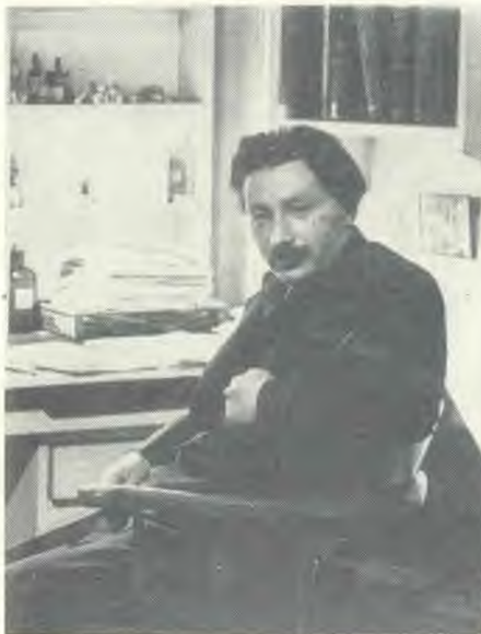
Dr. Chain, formerly of Germany and now a British subject, who has had an important part in developing penicillin, the wonder cure of modern drugs.

Cambridge Press. The possibilities in the use of this translation are bright. Basic English reduces the vocabulary of the English language (already the most widely used language in the world) to about eight hundred words, hardly any over two syllables in length. An intelligent person, whatever his mother tongue, can learn it in a matter of weeks, some in three weeks. This translation is another demolition bomb dropped on the Babel of earth's languages, for it will enable God's message for this time to be heralded quickly in spite of unknown tongues. What a striking fulfillment of the prophecy, "This gospel of the kingdom shall be preached in all the world for a witness unto all nations; and then shall the end come." Matthew 24:14.