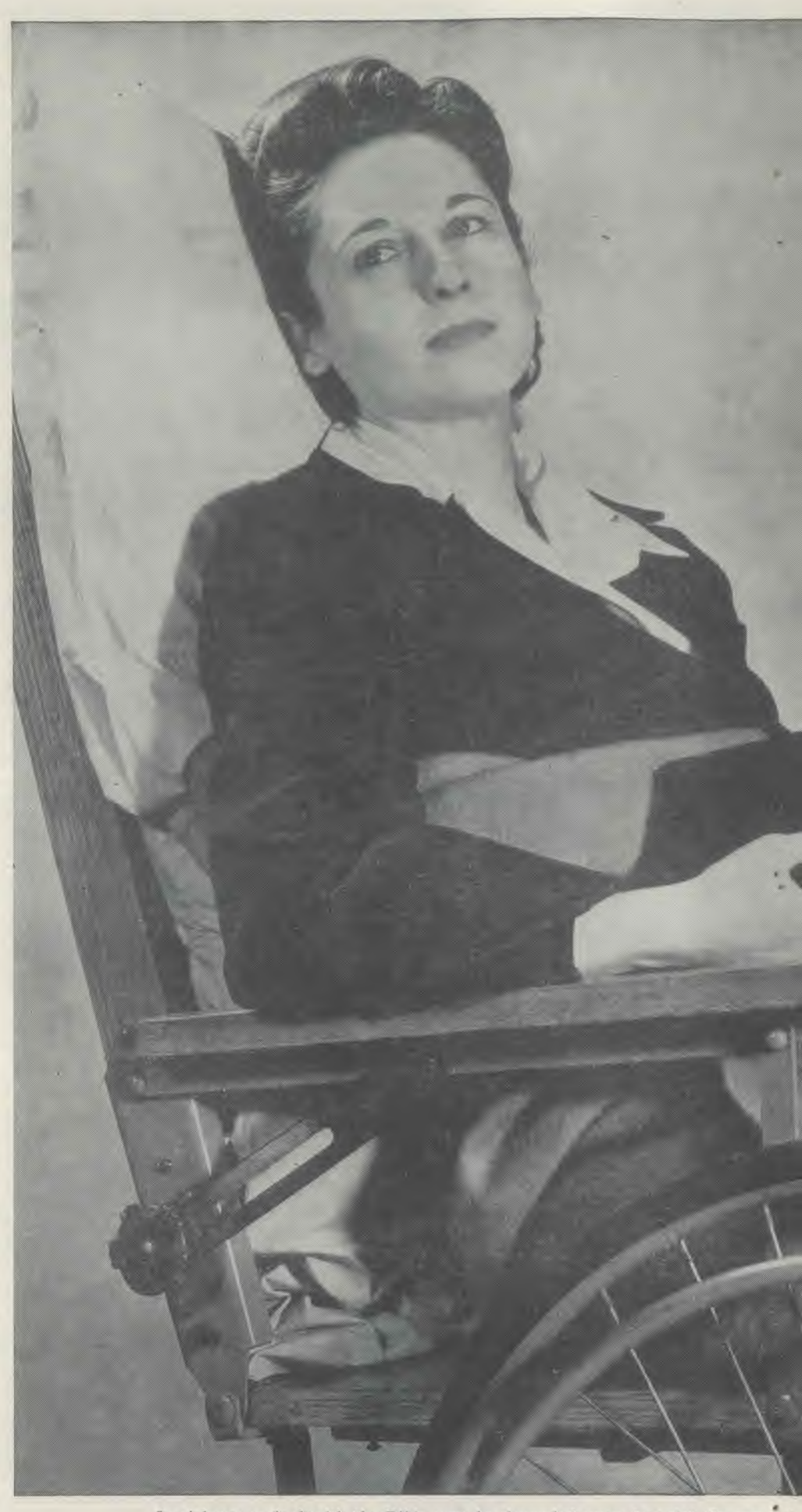
In sickness or in health the Bible may be depended upon to point the way of its pages the "plan of salvation" is set forth in all its convincing glor

It is not necessary, therefore, for any person in considering this question of the Bible's trustworthiness to abandon either his faith or his common sense and incontinently swallow the vague