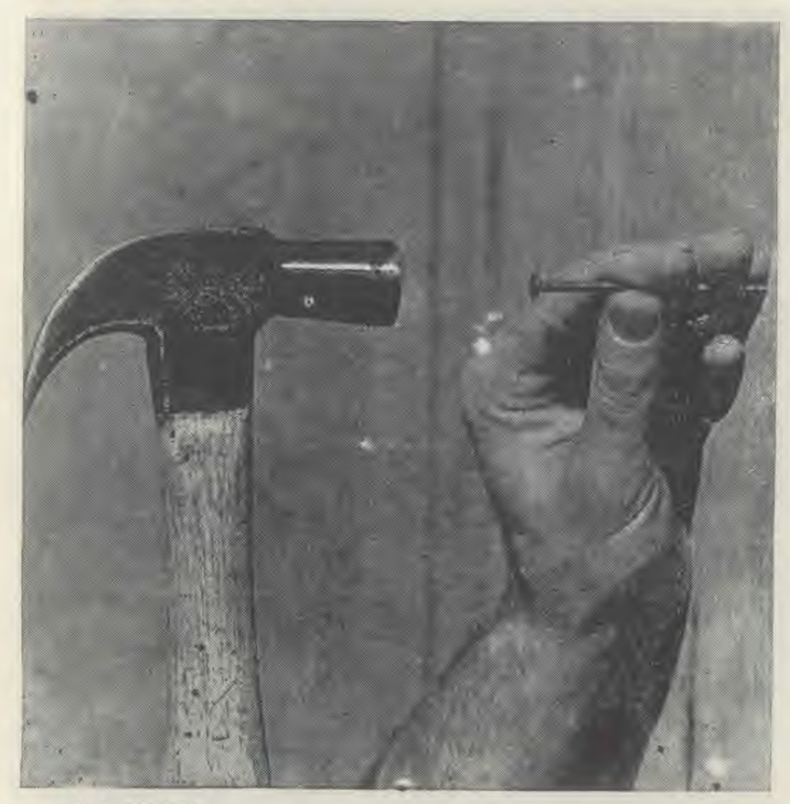
Is Sunday a day of rest or work? According to the Lord's Day Alliance you must rest; according to the Bible it is a working day, the first one of the week.

The aforementioned editorial finds fault with the Lord's Day Alliance for having closed the community concerts, which were held after church, and which were of a highly cultural nature, because of payments having been made to certain of the appearing artists. This, says the editor, has drawn criticism down upon the heads of the Lord's Day Alliance people because of the fact that the bowling alleys and billiard parlours remain open.