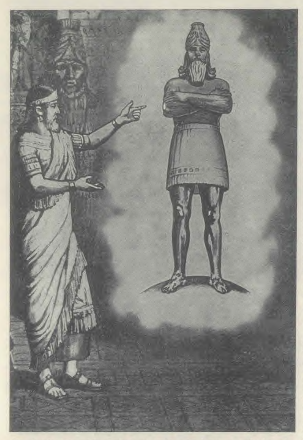
More than two thousand five hundred years of the world's history was outlined in a few minutes by the young prophet Daniel—prophecy that subsequent events have proved to be accurate to the letter.