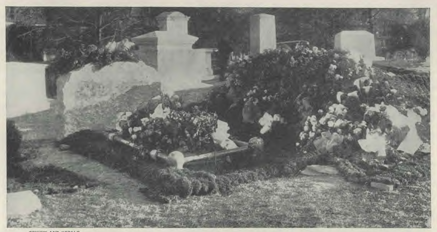
Was Pope Pius able to circumvent this divine decree and return from the "land of silence"? We think not. "The living know that they shall die: but the dead know not anything." Ecclesiastes 9:5.

How important it is, then, that the people of God should fortify themselves by a constant and diligent study of the Word, that they may detect the deceiver in whatever "disguise" he may assume, and so be preserved blameless until the coming of our Lord in glory for His own.