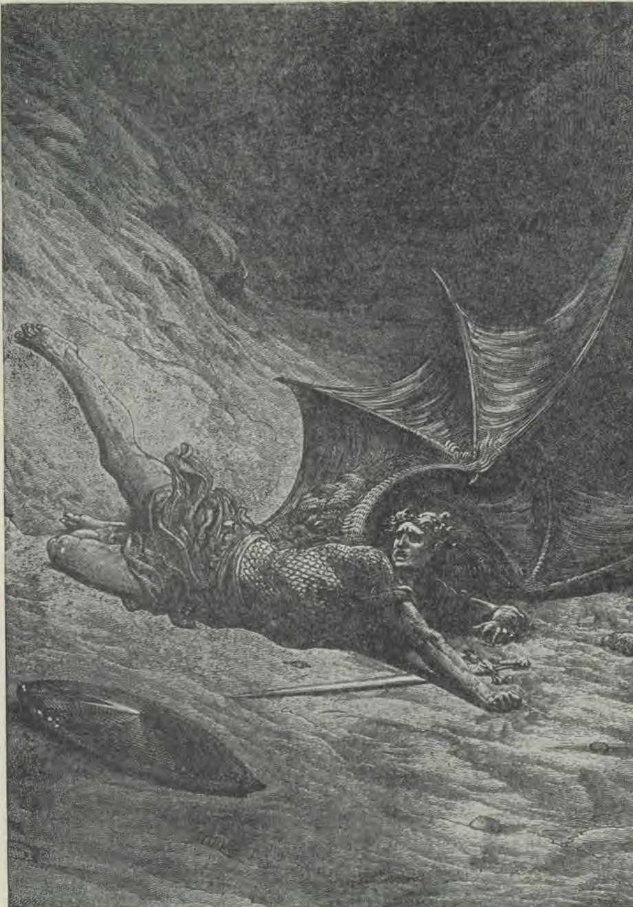
G. DORE, ARTIST

Motivated by pride and a spirit of self-exaltation, Lucifer, a high and honoured angel in heaven, introduced sin into the universe. Soon after his fall he was cast out of heaven to this earth where he, by lying deception, accomplished the fall of the human family.