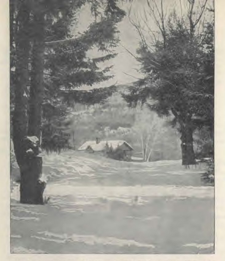
The time was when the snow-capped polar regions enjoyed a lovely tropical climate. Tropical plants grew there in abundance and tropical animals fed upon them. It is believed that a radical climatic change was effected at the time of the flood.

"Fifteen cubits upward did the waters prevail; and the mountains were covered. And all flesh died that moved upon the earth, both of fowl, and of cattle, and of beast, and of every creeping thing that creepeth upon the earth, and every man: and in whose nostrils was the breath of life, of all that was in the dry land, died.