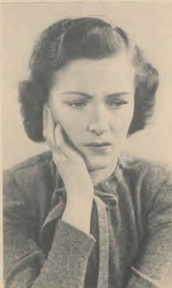
An adequate intake of vitamins in their natural state will solve many ills.