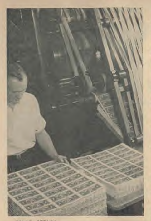
Some are depending on money to save their lives, but others are relying upon Jesus.