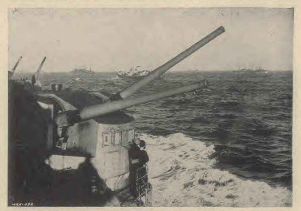
The climax of history is fast approaching. It is time to accept salvation, to watch and be ready.

The sign in the East could not be seen five hundred years ago. Then it was impossible to assemble the kings of the whole world. Some nations were not yet born. Communication and transportation were not sufficiently developed. Even one hundred years ago America was young, Africa was dark, and Asia was sleeping. Armageddon at that time was impossible. But not so today. The world is now small and Armageddon in the land of Palestine is at the crossroads between East and West. It is in the right spot to become the storm centre of the last days. Great powers covet this territory for military and economic reasons. The Jews claim it as their homeland; the Mohammedans count it