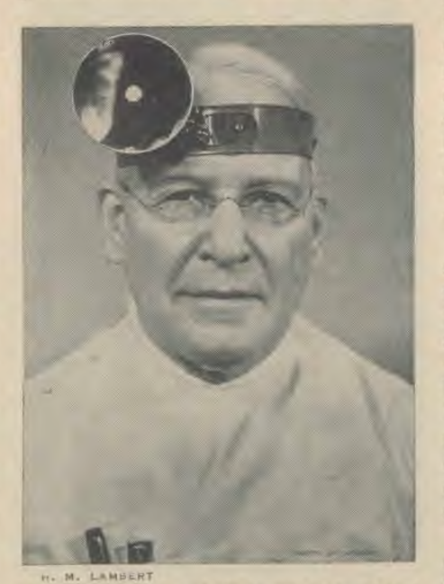
In God's great plan of lifting mankind, medical science and religion are united.

discovered that he was the victim of autointoxication, resulting from the decay and fermentation of foods in the alimentary tract. This man's mental condition had to be reached through the stomach. When he had been placed upon a correct dietary and had taken some simple treatments, these horrible symptoms gradually disappeared. The poisons formed in the alimentary canal