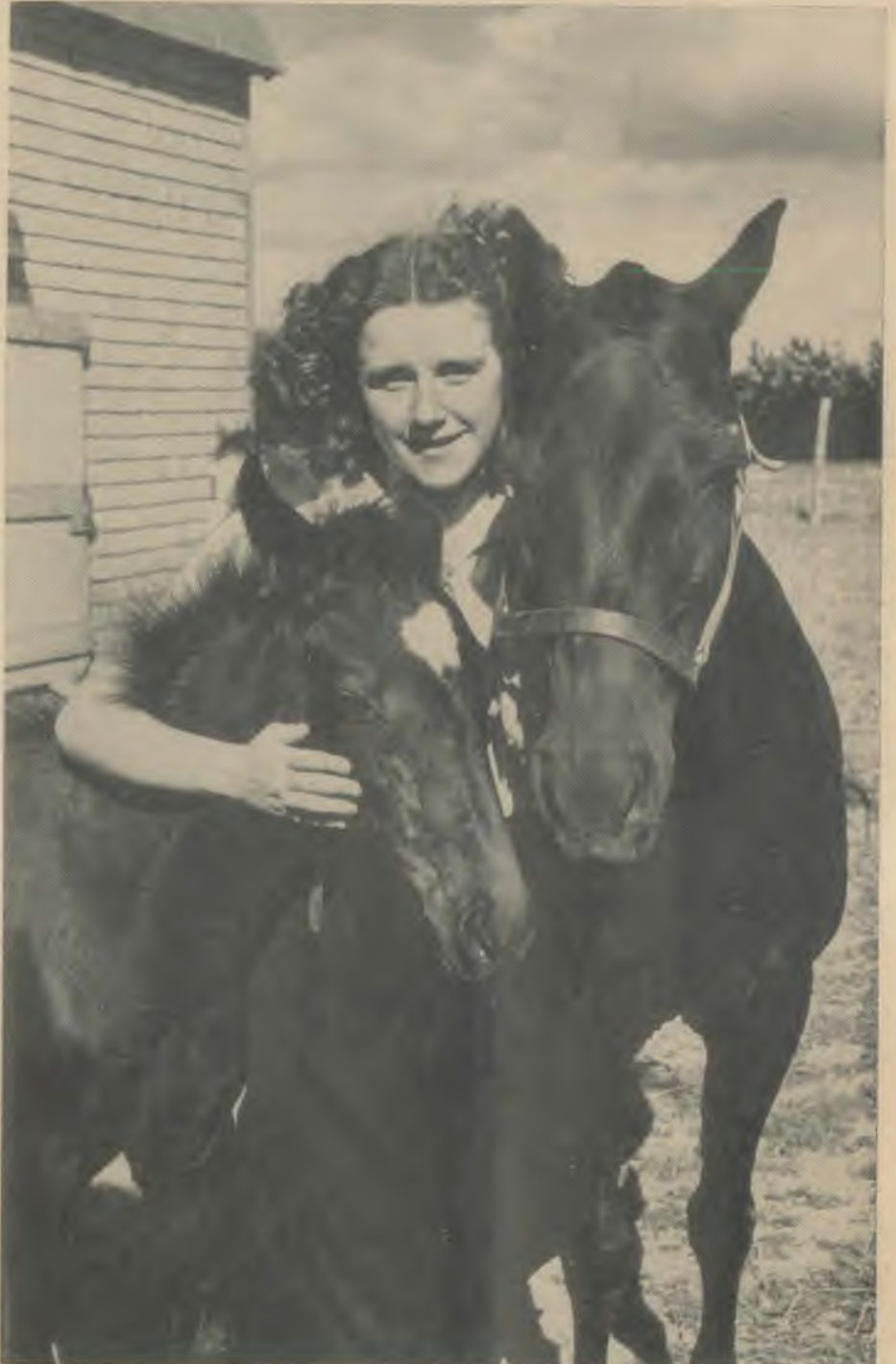
CANADIAN NATIONAL RAILWAYS

Signs of The Times, published monthly by the Kingsway Publishing Association (Seventh-day Adventist), Oshawa, Ontario, Canada. Authorized as second-class mail, Post Office Department, Ottawa, Ontario, January, 1921. Subscription Rate: Single yearly subscription, $1.50 within the British Empire (to U.S.A. and foreign countries add 25 cents extra for postage); single copy, 15 cents. Change of Address: Please give both old and new addresses. Expiration: Unless renewed in advance, the magazine stops at the expiration date given on the wrapper. No magazines are sent except on paid subscriptions, so persons receiving the Signs of The Times without having subscribed may feel perfectly free to accept it.