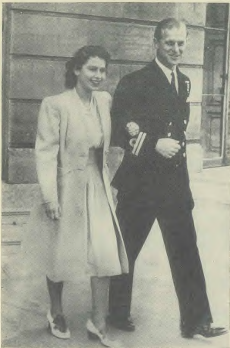
STAR NEWSPAPER SERVICE

The world has known but one theocracy—that in the days of ancient Israel.