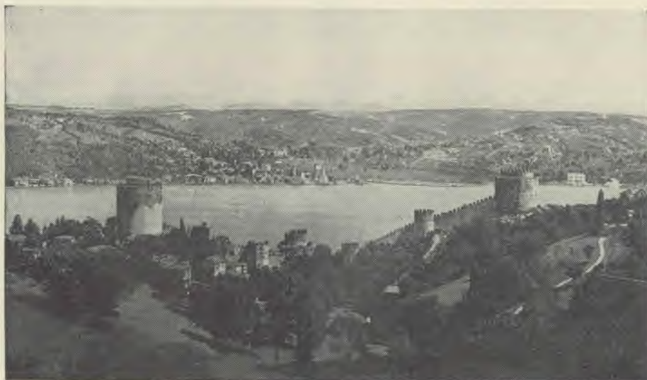
REVIEW AND HERALD

Turkey, sitting astride the "strategic Straits," and supported by stronger powers, has long been an obstacle to Russia's ambitions.