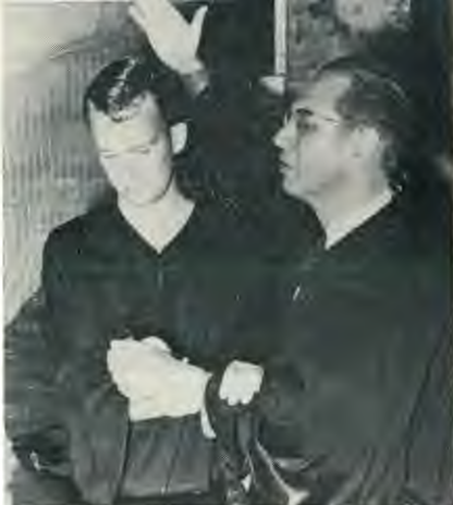
Faith for Today's decision meetings have seen several hundred baptisms. Future meetings are planned for Los Angeles, California; Indianapolis, Indiana; Phoenix and Tucson, Arizona; Albany, New York, as well as several other centers.