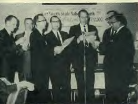
Workers who have joined the Texas Conference during the past year sing a special song expressing their Ingathering enthusiasm.