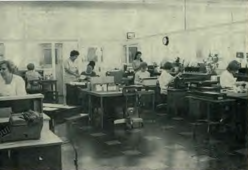
In Faith for Today's file room are more than 140,000 names of viewers, Bible course students, and individuals who view the program. Maintaining these records is a tremendous assignment. At Faith for Today every name is regarded as a sacred trust.