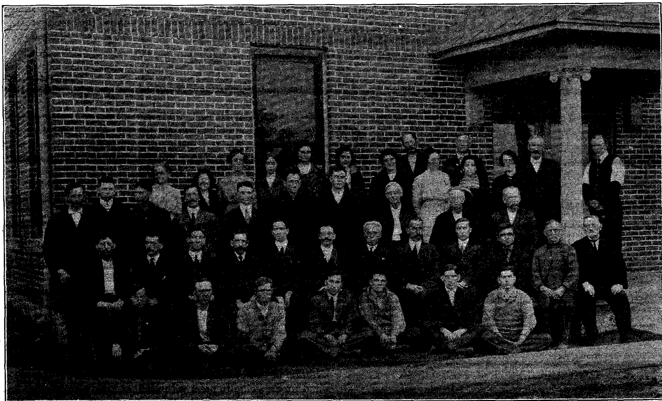
EMPLOYEES OF THE SOUTHERN PUBLISHING ASSOCIATION, NASHVILLE, TENN.