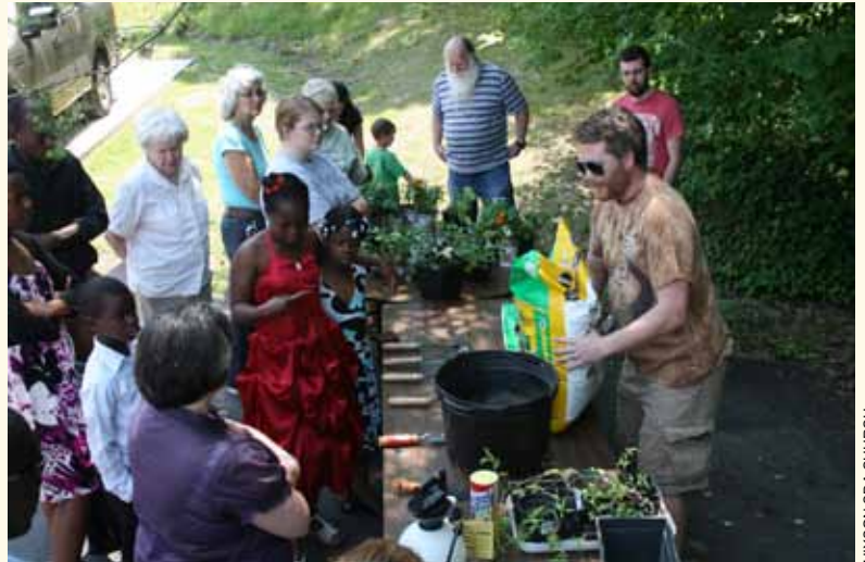
HIXSON SDA CHURCH

A delicious vegetarian meal was served hot off the grill. Participants enjoyed discussing what they had learned over plates of veggieburgers, grilled vegetables, and grilled pita sandwiches. Everyone listened intently as Tabitha Boatswain