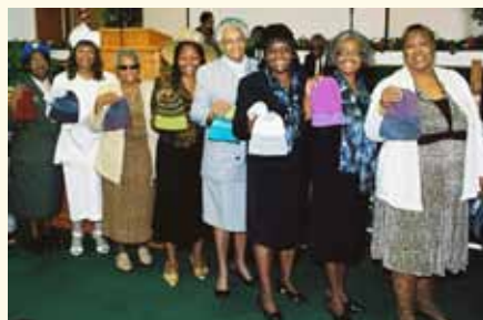
Progress Village women display the hats they made for the community homeless and the seniors at their church.