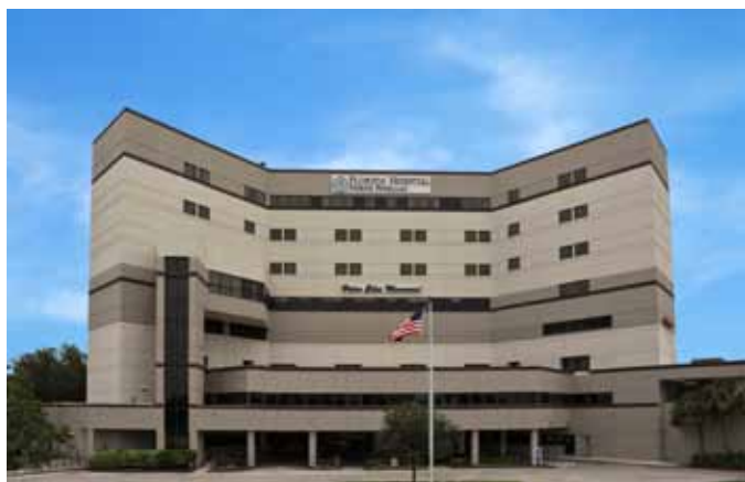
Florida Hospital North Pinellas is the new name for exceptional health care in Tarpon Springs and the surrounding region.