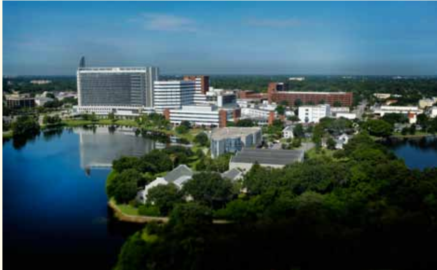
Adventist University of Health Sciences (foreground) and Florida Hospital Orlando campus

With the support of Adventist Health System, ADU will seek to develop business leaders who practice healthcare as a ministry. Generally, clinicians are seen as the ones who extend the healing ministry of Christ, but there are many non-clinicians who work in conjunction with clinicians to make this goal possible. The MHA, a two-year program, will offer leaders in both environments an opportunity