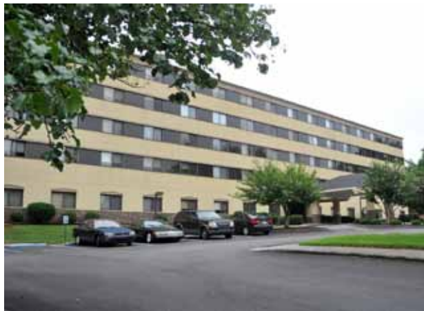
First Seventh-day Adventist Church Towers in Huntsville, Alabama, has been providing assisted-living housing for the past 25 years.

What has contributed to this change? Average life expectancy has increased by 30 years, so that in the United States life expectancy has increased from 47 years in 1900 to 78 years today. Today's seniors