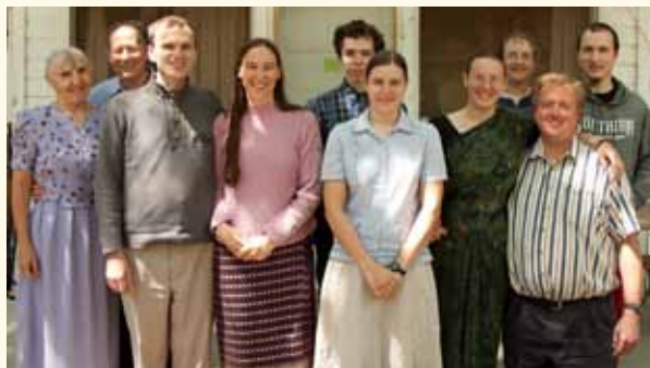
The Calkins Family