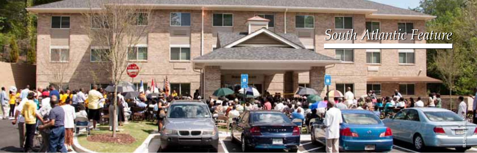
Front view of Borean Village and Senior Services Center