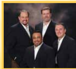
The King's Heralds