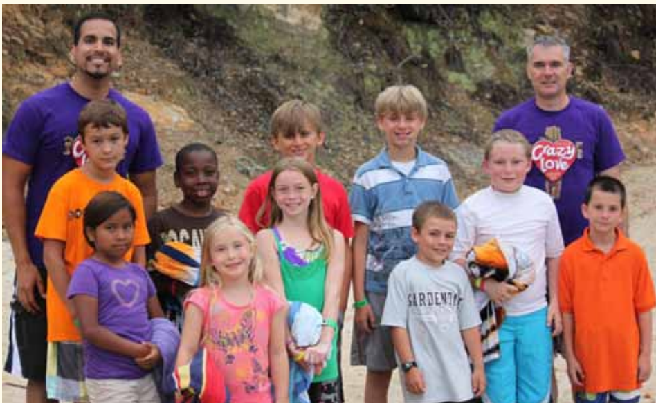
This group of youth were baptized during Adventurer Camp.