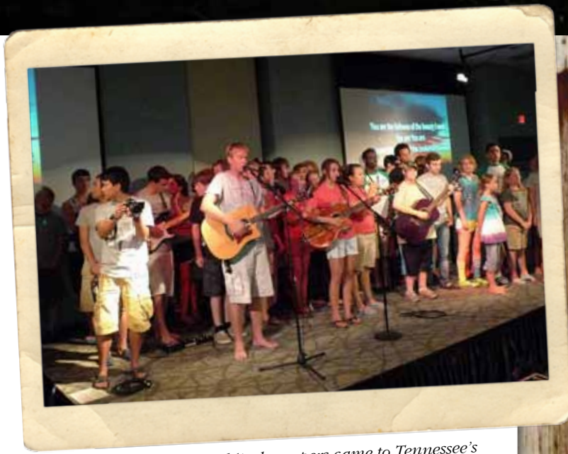
On June 10-16, 2012, 53 blind campers came to Tennessee's Indian Creek Camp for fun and inspiration. National Camps for the Blind Children, an affiliate of Christian Record Services for the Blind, are the organizers. In 2012, its 45th year of operating the camps, 14 of them will be organized in the United States and Canada.

"So how often does a blind camper hit the target?" is a common question to ask. The exercise is obviously designed to increase self-confidence, discover undeveloped potential, and try the unusual sport activity. "I don't tell campers they have