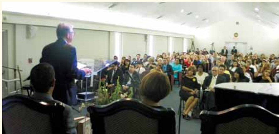
Kendall Spanish Church’s new sanctuary was filled to capacity at the dedication service.

After a long wait of 20 years, Kendall Spanish Church, Miami, Fla., is worshipping in its own building, thanks to the work and contributions of dedicated members and those interested in the progress of the church. From June 8 to 15, members celebrated the blessings of God at Sabbath worship services