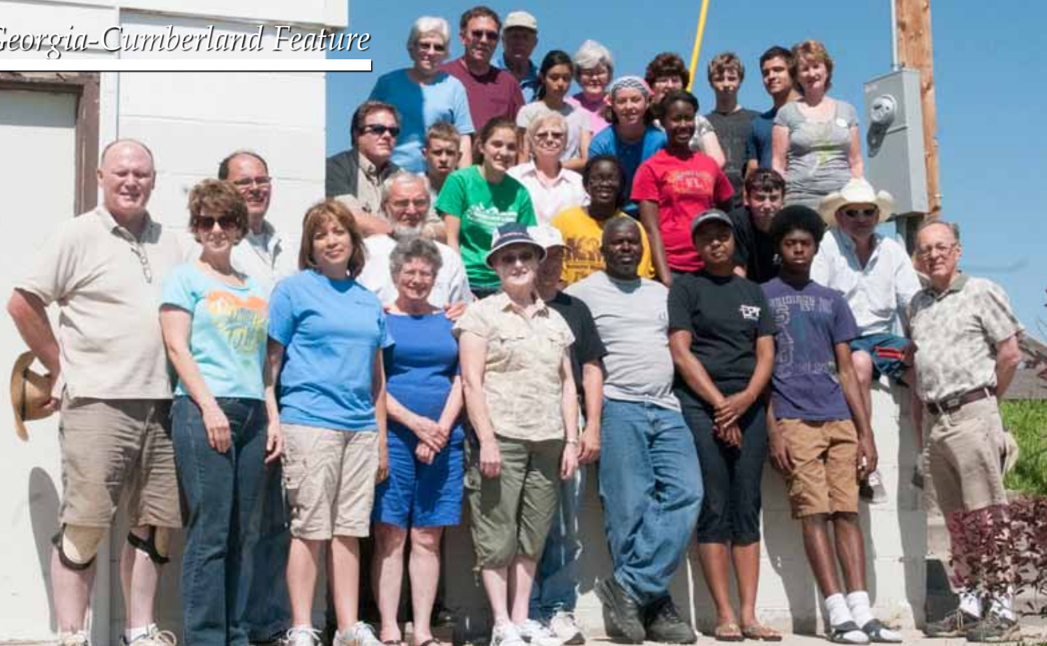
The Payaba Mission Church in Pine Ridge, South Dakota, was the location for a mission trip for three ministries from Georgia-Cumberland Conference: Pathfinder Missions, 3-Point Play, and God in Shoes. Pine Ridge is located on an Indian Reservation.