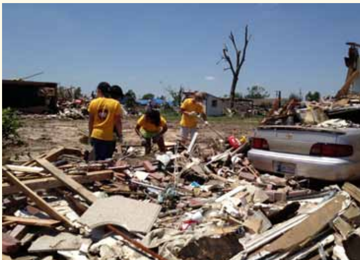
A small group from Collegedale Church headed to Moore, Okla., June 9-16, 2013, for a mission trip. They went to help where they could, and were led by God to those in need.