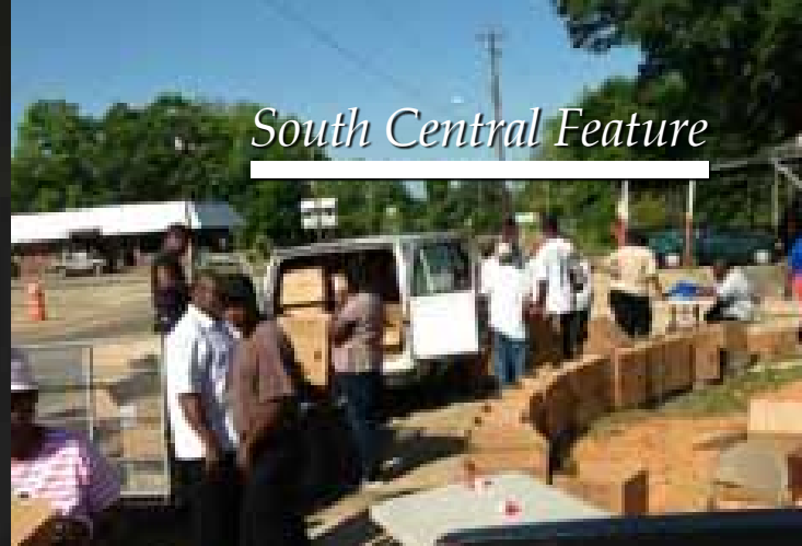
Wal-Mart, through the Selma Food Bank, delivered a shipment of food to Temple Gate Community Center in Selma, Alabama.