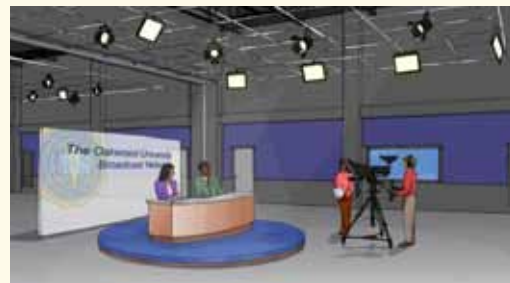
Artist sketch of Oakwood University Broadcasting Network Studio

our entire lifetime; it lasts, not simply for four years, but for 40 years! It is academically rigorous and emotionally gratifying — faith is integrated with learning. The Oakwood Experience is set in the American South, and it transcends the South. It arises from the blood-soaked sod of a former slave plantation. It flows east, and west, and north, and around the world — where Oakwoodites are found! Its music is bathed in the rhythms of black-church spirituality. The Oakwood Experience is connected by lasting friendships and joyous reunions. Caring teachers, loving staff, and wonderful students — the Experience spans generations. It is God-appointed, faith-grounded, and service-centered. The Experience puts God first! It is transformational, inspirational,