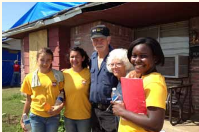
A group of nine headed out to Moore, Okla., to make a difference. They went door to door to make sure people were doing well, and were able to share the love of God through prayer and hard work.

It was amazing how almost everyone who had damage or lost their homes