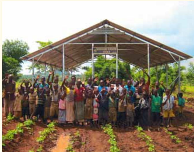
Chikungu Adventist Church members in Malawi have a new pavilion to meet in.