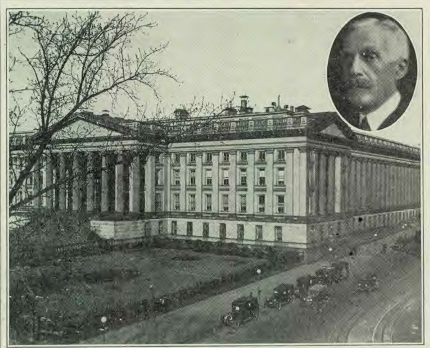
The United States Treasury is one of the world's storehouses of wealth. Currence, from the Bureau of Engraving and Printing finds storage here. Cash transactions at the Treasury amount to millions daily.