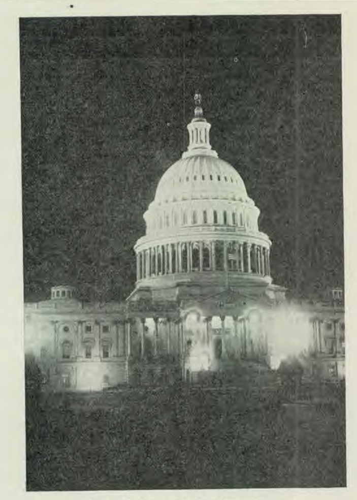
Hail. Washington! Our Washington!

At the conclusion of the program, an invitation was extended to the band to revisit them soon.