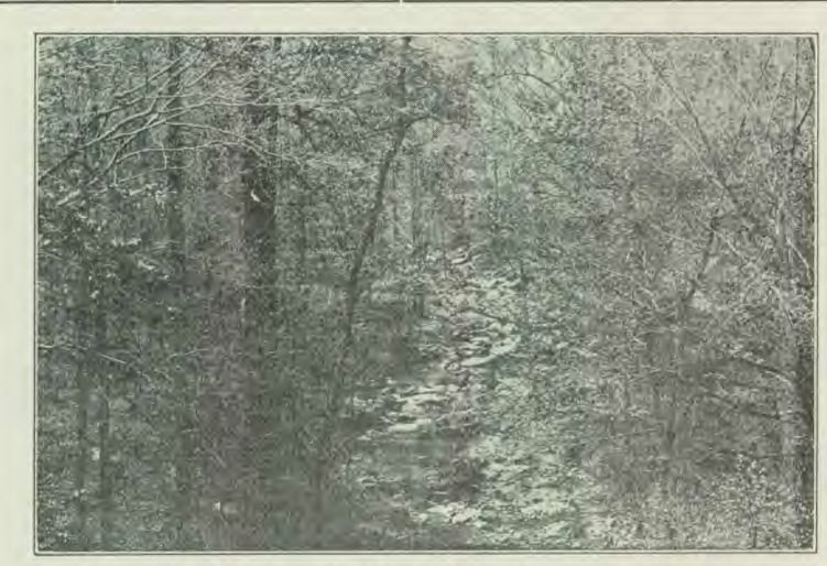
Sligo Creek, from which The Sligonian received its name

After 30 minutes of fighting the beginning in 1890. flame which partially destroyed a