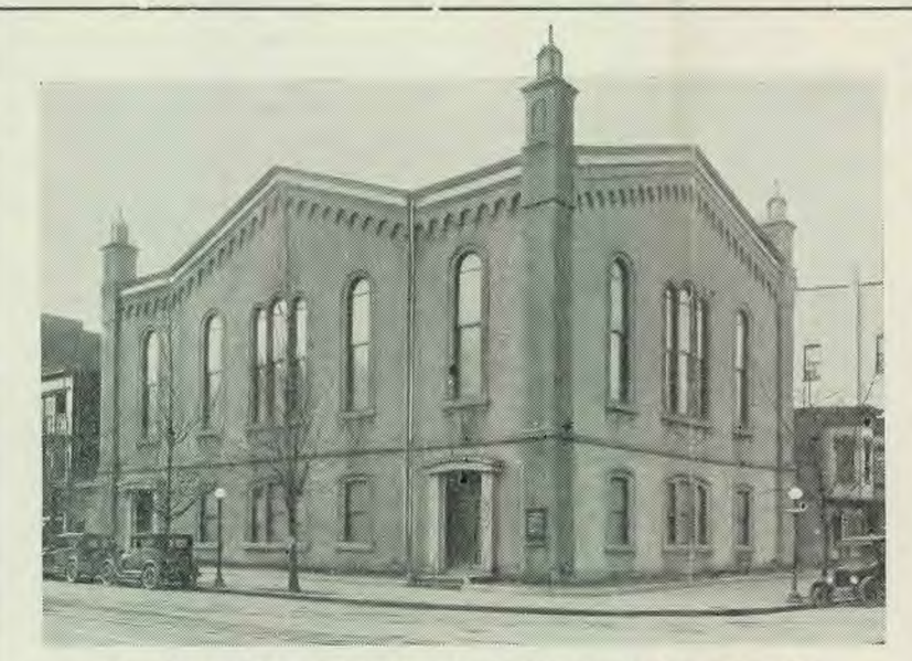
The Capital-Memorial Church, first Seventh-day Adventist Church in Washington, D. C.