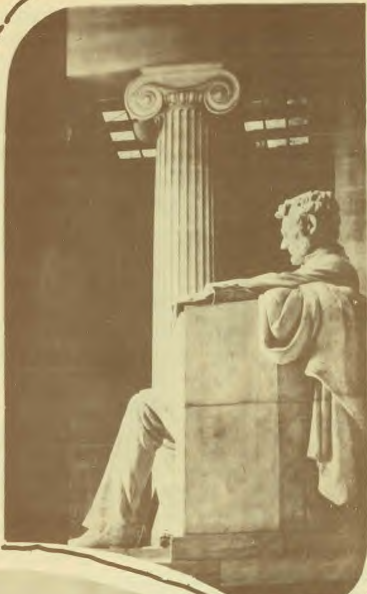
Harris & Ewing

r of learning and culture. It offers at only the nation's capital can f these splendid opportunities? ure and music are featured tal and the student who dvantage of them.