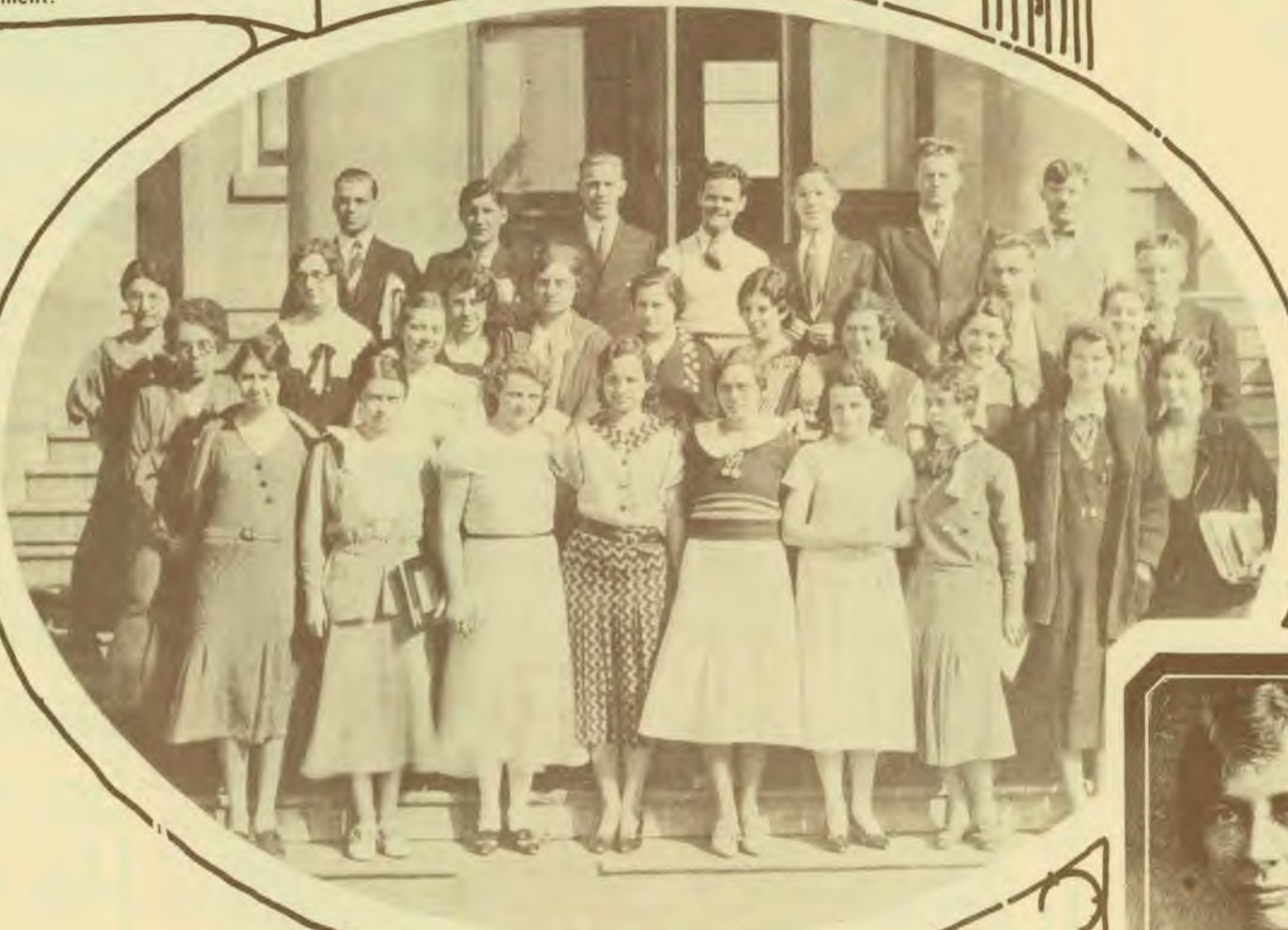
Student teachers enrolled in the Normal Course. The field of teaching is fast becoming popular in Columbia Union.

A high degree of efficiency is maintained. Teachers entering the work in this Union must hold certificates from the Educational Department of the Columbia Union.