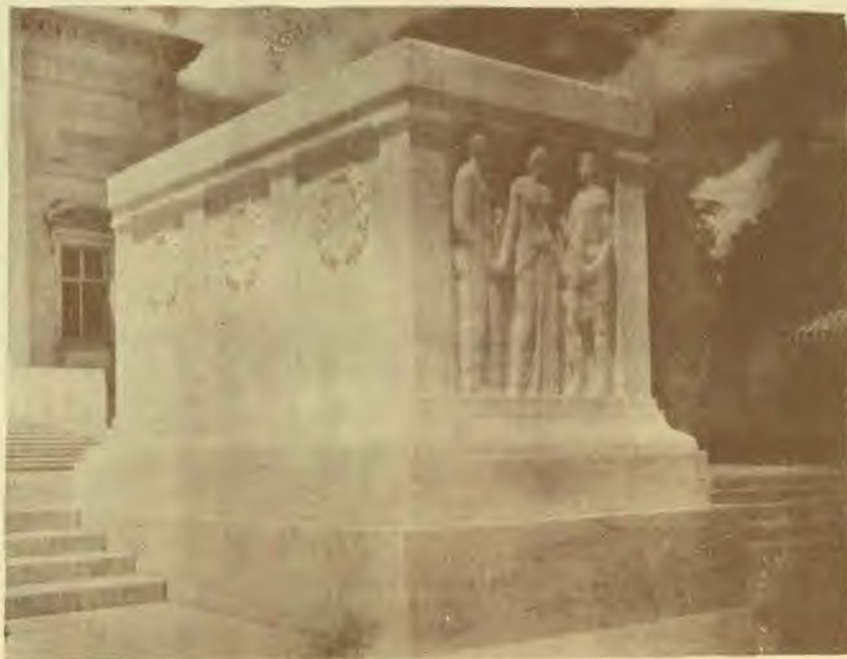
Tomb of the Unknown Soldier, Arlington Cemetery

GIVE GOD A CHANCE GO TO HIS SCHOOL. PLAN NOW!