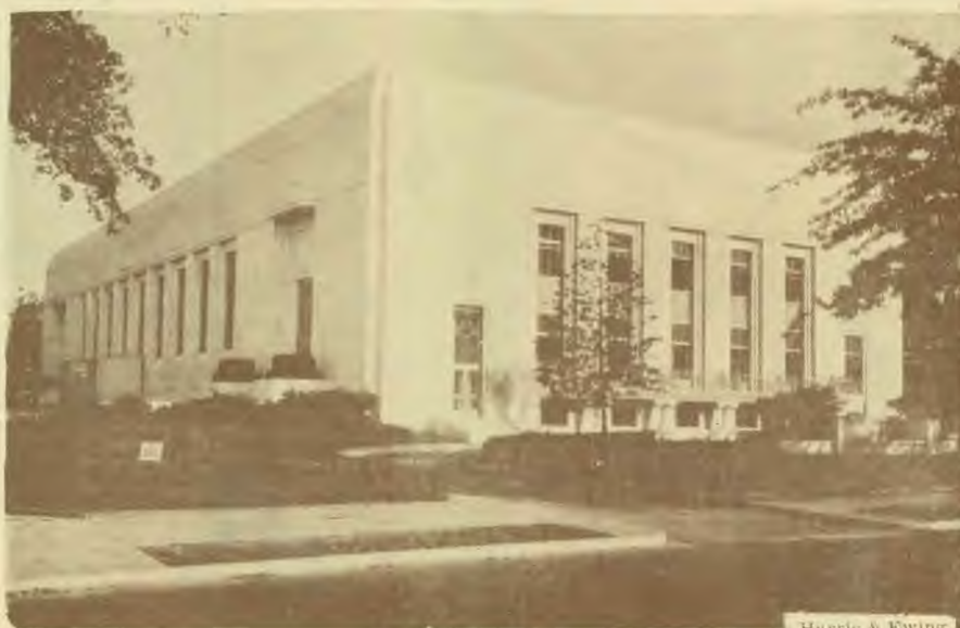
Harris & Ewing

THE FOLGER LIBRARY —Situated just across the street from the Library of Congress this comparatively new institution bids fair to become as popular and as useful as it is beautiful.