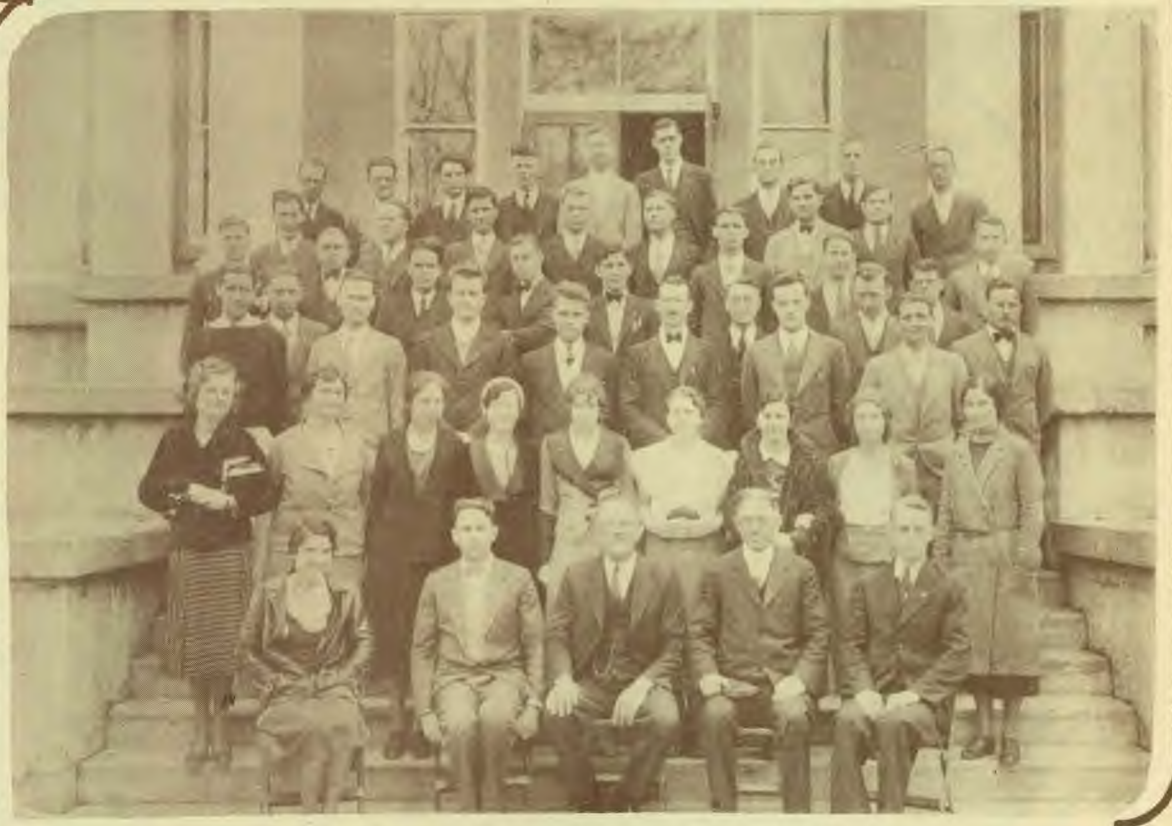
Students enrolled in the Theological Department.

Splendid interest and success also attend the endeavors of the students at McLean, Va. The interest there grows apace. Photos on this page show those students engaged in these two efforts.