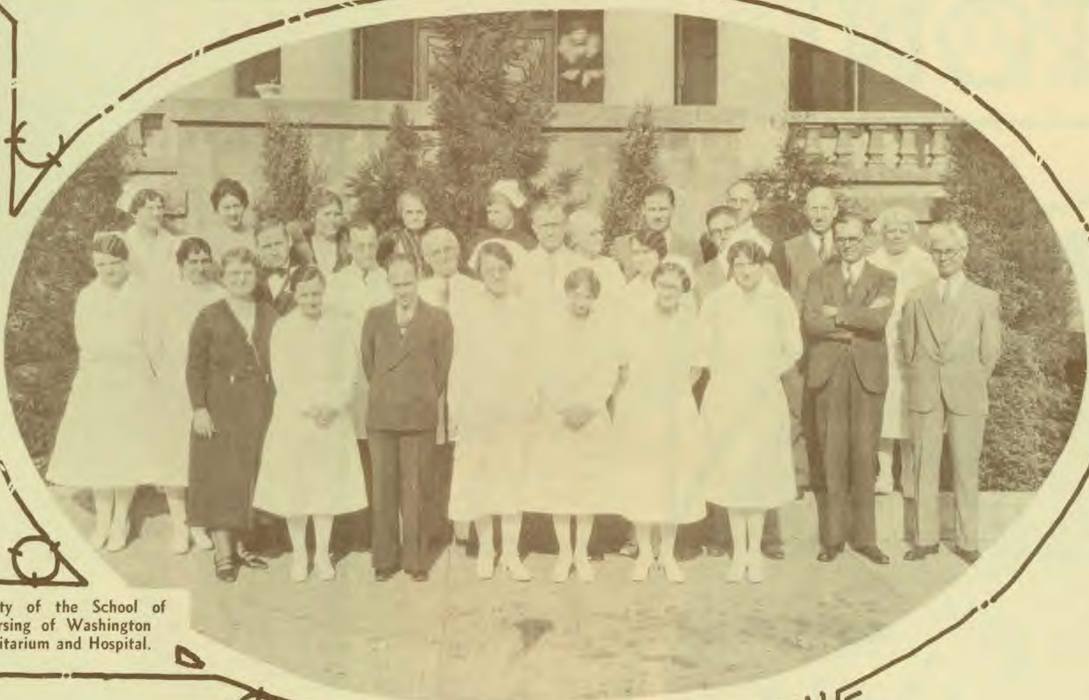
Faculty of the School of Nursing of Washington Sanitarium and Hospital.