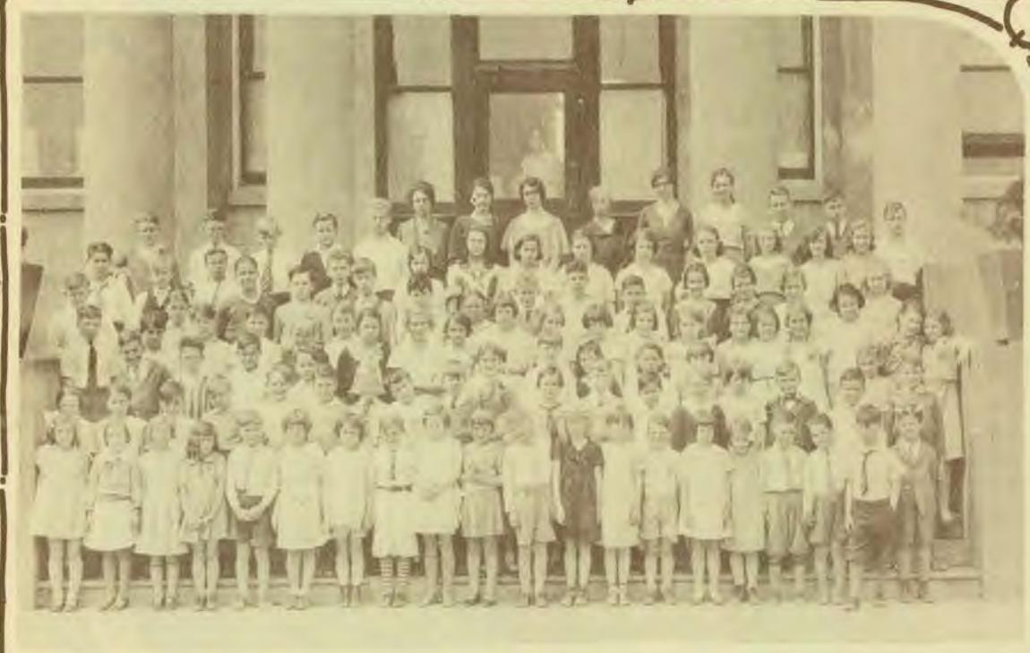
Pupils and teachers under the direction of the Normal Department.