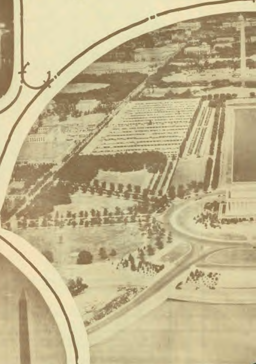
Air view—Arlington Bridge, Lincoln Memorial, and the U. S. Capitol flanked with the government buildings—an interesting sight.

U. S. CAPITOL —A beautiful building made more so at night by expert lighting. Ninety per cent of the visitors who come to Washington visit the U. S. Capitol. Here the student can visit his state senator and listen from the splendid galleries as laws are made.