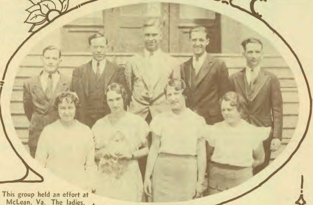
This group held an effort at McLean, Va. The ladies, each one an efficient nurse, added much to the success of the work.