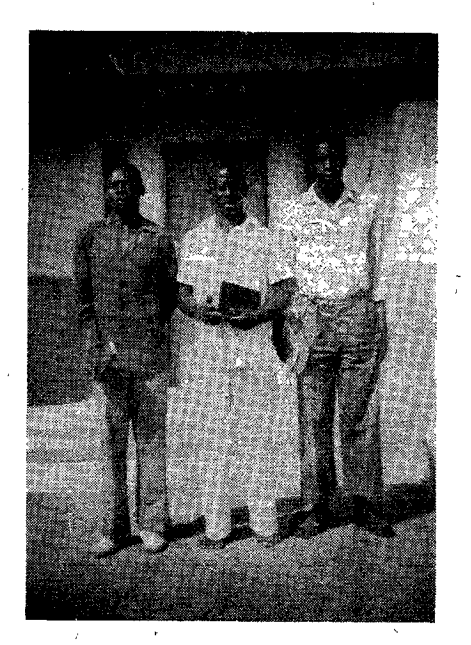
Butata Voice of Youth Preaching Band.

Before the plan was put into operation five institutes were conducted in each church district, and more than 50 young people attended the institutes. Instruction given included such topics as: The challenge of the hour for our youth; How to organize Voice of Youth teams; Methods of approach; How to secure lists of backslidden and non-S.D.A. young