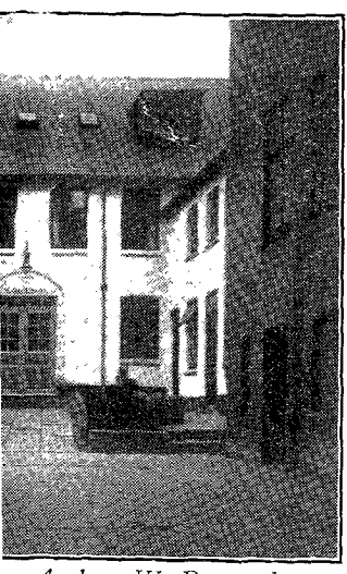
g, Aarhus, W. Denmark.

force. At present there are four ordained ministers, three licentiates, and four Bible-workers. During 1935 these workers laboured in ten to twelve different places. The Danish population is, generally speaking, rationalistic and non-religious, and it is difficult to gather many people to meetings. In spite of this our membership grows steadily year by year. Last year 113 new members were added.