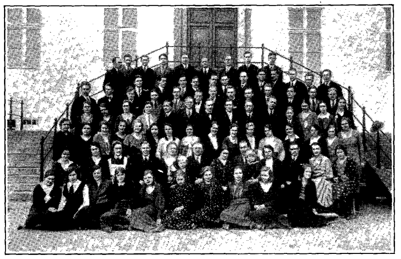
Faculty and students at Ekebyholm Mission School.