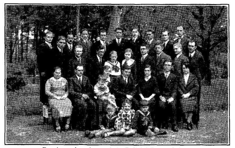
Faculty and students of the Polish Mission School.