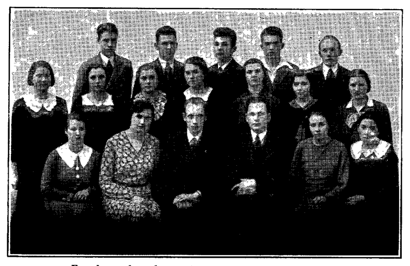
Faculty and students of the Estonian Mission School.