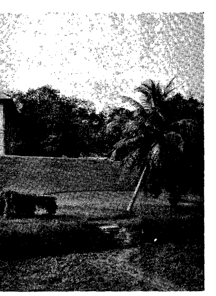
rn Division in Singapore