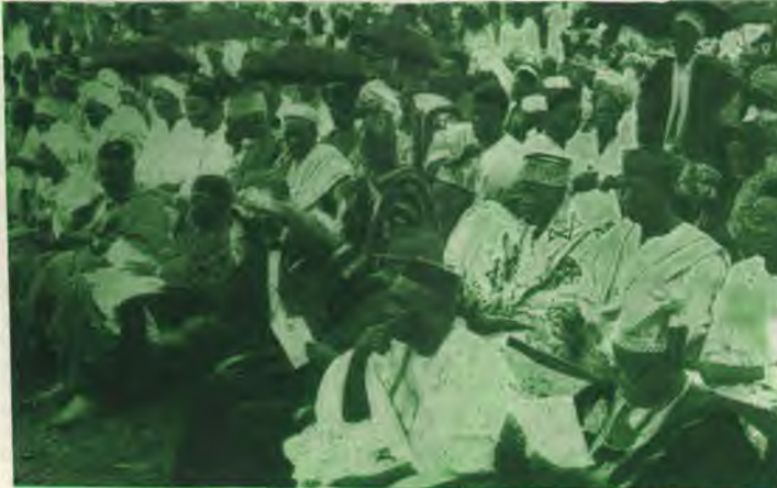
A portion of the huge crowd which witnessed the ceremony.

For such an infant institution, the Adventist College of West Africa has had an unusual amount of world-wide publicity since the inaugural ground-breaking ceremony on its campus September 17, 1959.