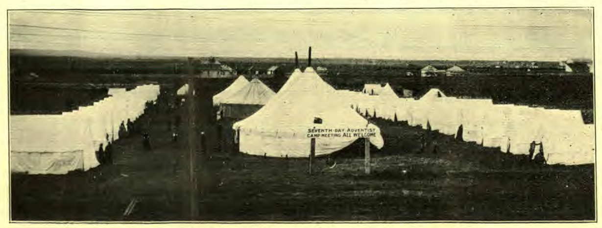
THE ALBERTA CAMP GROUND

During the past year 196 persons were baptized, and 232 received into church fellowship. The total