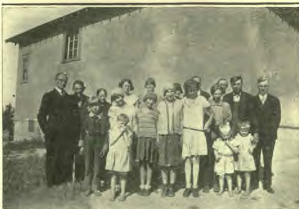
A NEW SABBATH SCHOOL

We enjoyed the four weeks that we were able