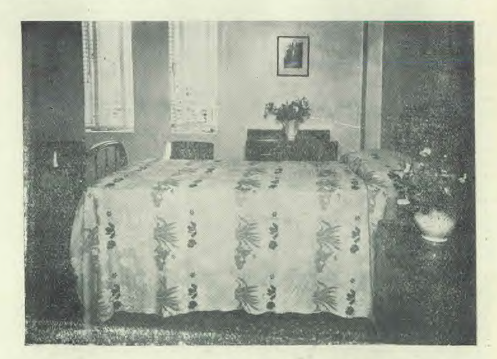
A typical room in the new building containing bed, bedside table, chest of drawers, chair, running water, clothes closet, lavatory and shower.