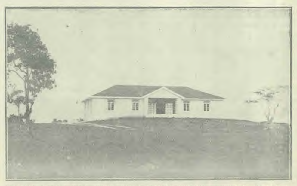
THE NEW BRITISH WEST INDIES UNION MISSION BUILDING WHICH WAS COMPLETED DECEMBER, 1919.

ANSWER: God claims the tenth of the possessions that have come to us as His own, for the advancement of His work in the earth. Jacob recognized this when he said, "If God will be with me, and will keep me in this way that I go, and will give me bread to eat and raiment to put en, so that I come again to my father's house in peace, then shall the Lord be my God; and this stone which I have set for a pillar, shall be God's house; and all that Thou shalt give me I will surely give the tenth unto Thee," (Gen. 28:20-22). The ancient Israelites were plainly told to pay a tithe of their herds, fruits, etc., which constituted in those days their substance. (Lev. 27:30, 32, 33.).