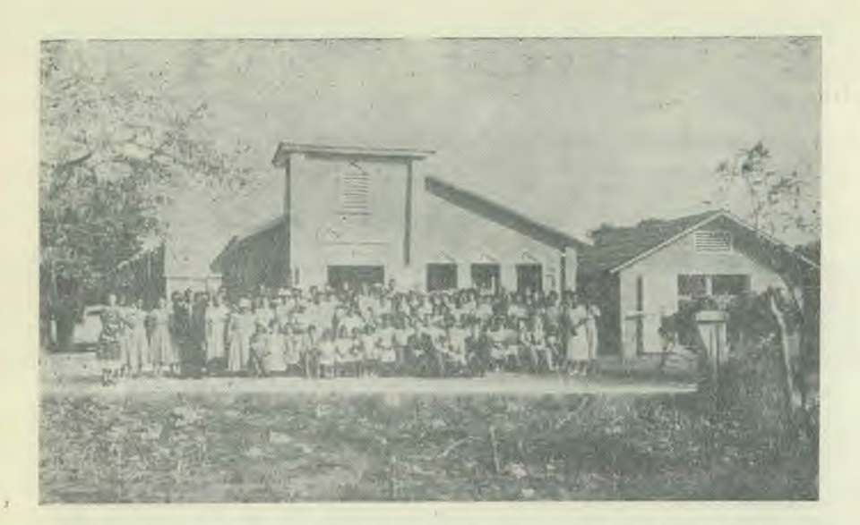
OUR DELEGATES TO THE 1950 CAYMAN MISSION SESSION HELD AT GEORGETOWN.