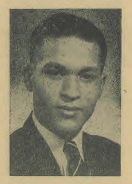
Educational Secretary, West Jamaica Conference,