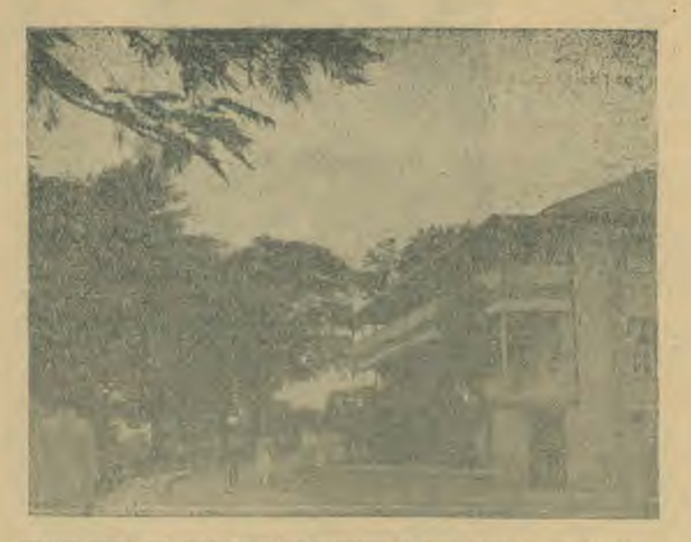
FRONT VIEW OF THE BOYS' DORMITORY, WEST INDIAN TRAINING COLLEGE, MANDEVILLE, JAMAICA.