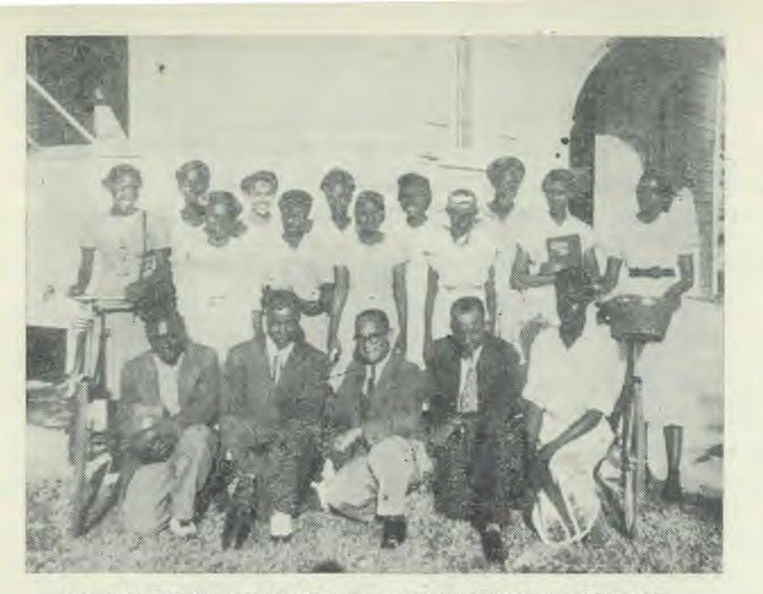
COLPORTEUR EVANGELISTS OF BAHAMAS MISSION