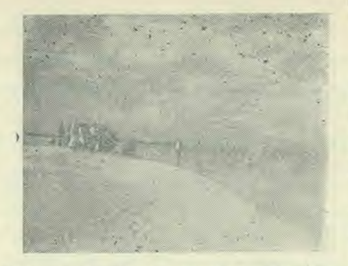
Elder B. E. Hurst conducting a baptism in Grand Cayman. The crystal clear water and the white coral sands afford a beautiful scene for newly-consecrated souls to come forth to a new life.

A lady from a nearby district visited one of our meetings. On that night the study was on "the Leopard Beast" of Revelation 13, proving to the people that the Catholic Church is that great eccle-