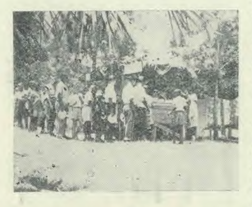
Camping Missionary Volunteers wait in line, ready to receive their portion of the noon meal at "Bamivoca", Nassau.