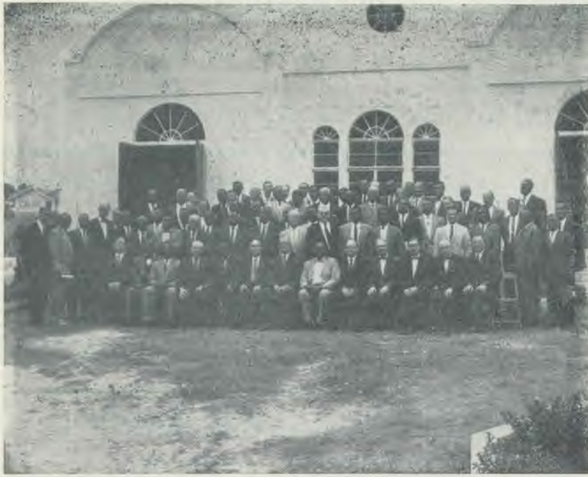
Delegates in attendance at the Third Quadrennial Session of the West Indies Union Mission, December 9-13, 1960, Mandeville S.D.A. Temple.