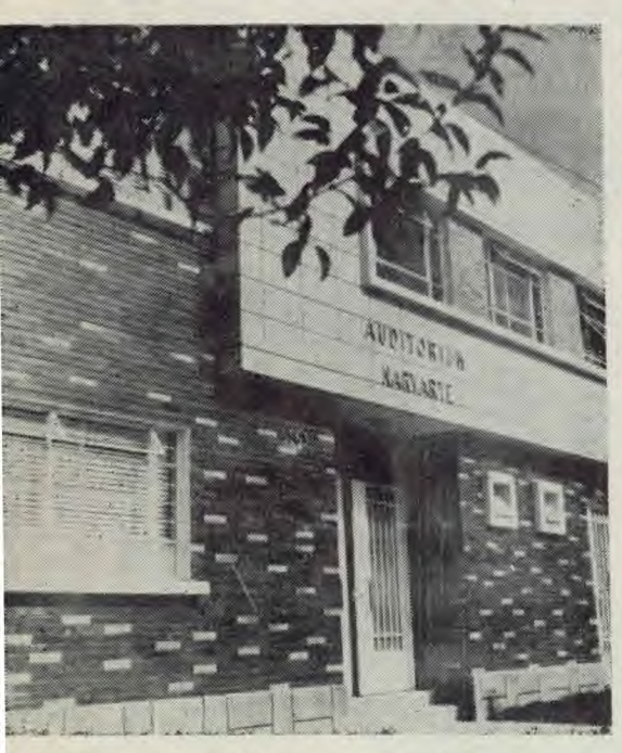
Many more auditoriums like this are needed in Mexico City with its teaming six-million inhabitants.