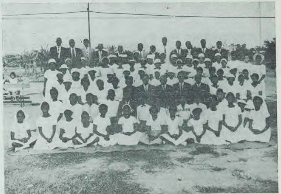
Baptismal Candidates — Penwood