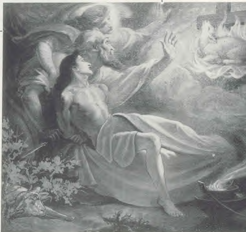
Abraham's test on Mount Moriah gave him a clearer understanding of the great sacrifice of God's Son on the cross of Calvary.

Death was a terrible lesson to Adam and Eve. They had by sin lost their covering of light and glory, and God made them coats of skin. (Genesis 3: 21.) These clothes were a constant reminder that sin