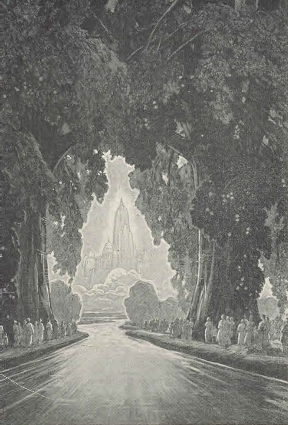
To dwell in the presence of God, and taste of the river and the tree of life, will some day be the privilege of all true Christians.