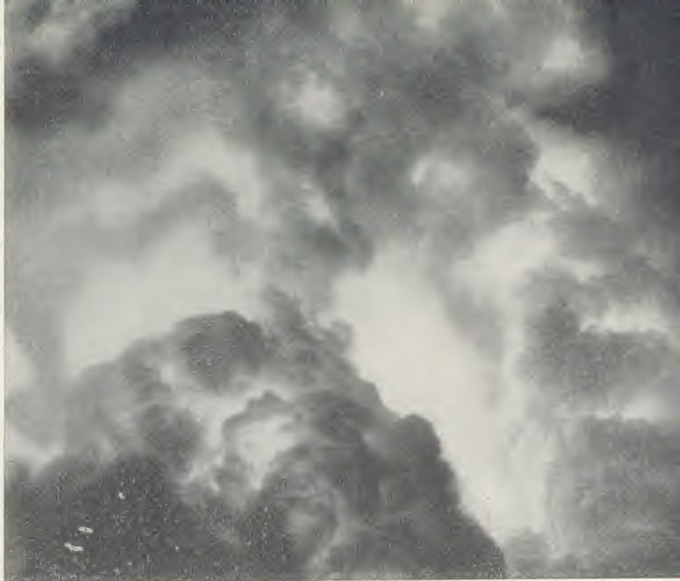
The world will some day experience a catastrophic holocaust that will destroy all sin and sinners.

In this sacred Book I read of a time that is coming, and is even now near at hand, when world disaster will sweep the whole