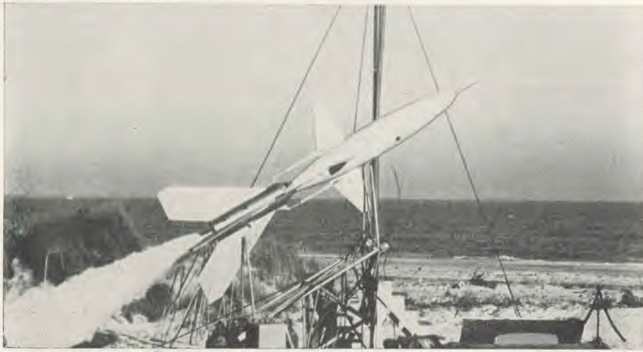
German scientists are working for Uncle Sam in the development of guided missiles. The next war will very likely see great destruction from rocket bombs containing atomic warheads. (See page 16 for a discussion of this subject.)

a lady visiting this country from Europe, appears in Time , January 13, 1947. The following excerpts from the account present a word picture of the outstanding events connected with the hazing: "The high-school girls . . . carried long bundles containing paddles, and pails for vomiting. . . . One girl was mixing a drink out of castor oil, cold cooking grease, coffee grounds, raw oysters, and mackerels' eyes. The first girl to be initiated was brought in, wearing a bathing suit and a blindfold. She was pale, trembling, and sweating. They made her lie on the floor, face up. Then one of the girls poured the concoction into her mouth. She choked and retched. . . . The girls told her: 'You goat, you have to drink it all.'