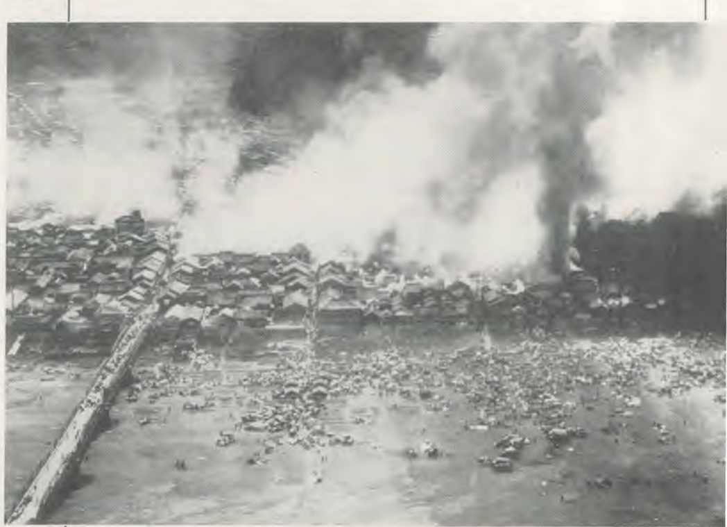
Catastrophes such as this in Shingu, Japan, where earthquake, tidal wave, and fire swept over the city, are forewarnings of the greater judgments of God that are impending.