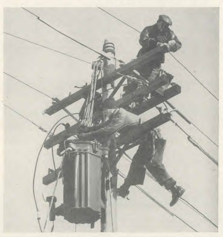
Linemen are well aware of the lethal power of electricity and take adequate precautions in handling it, but many householders forget that ordinary house current can kill.

stalled so that it can be reached directly from a bath tub instead of through a switch. Wet hands and a body in a bathtub filled with water offer an ideal "ground" for a strong current, and in this process of turning on a switch a "short," or the full power of the electric current, is concentrated in a small space and usually destroys life, or at least causes very serious injury and burns.