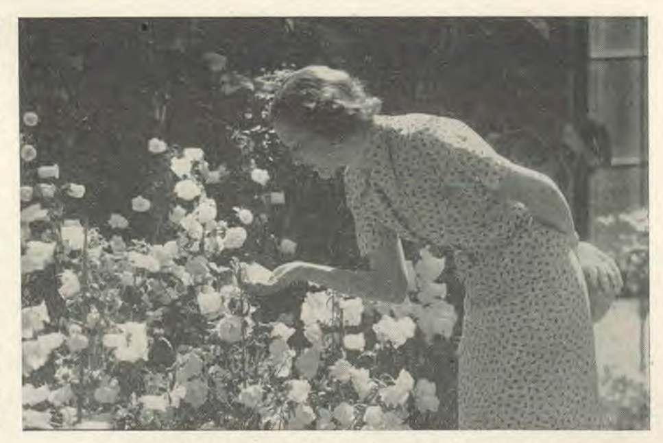
The omnipotence of God is much in evidence in the intricate and delicate designs in nature.

So I examine the machine carefully. I find that it has on the top an inclined, flat case, called a magazine, which has grooves or channels on its inner surfaces. Into one of these grooves my matrix slides easily, like scores of others. Both