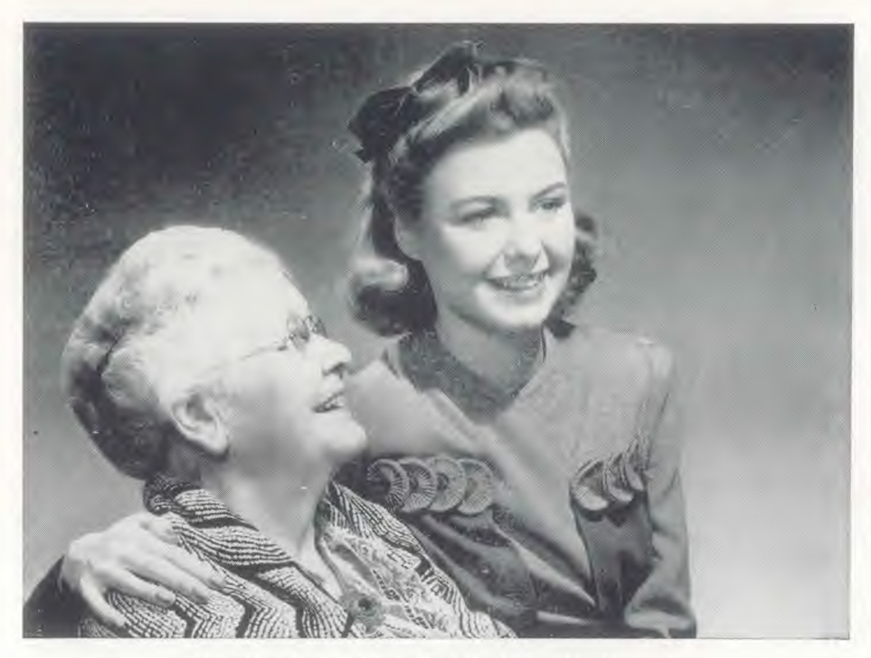
The world needs more of the spirit of friendship and kindness in this crucial post-war era.