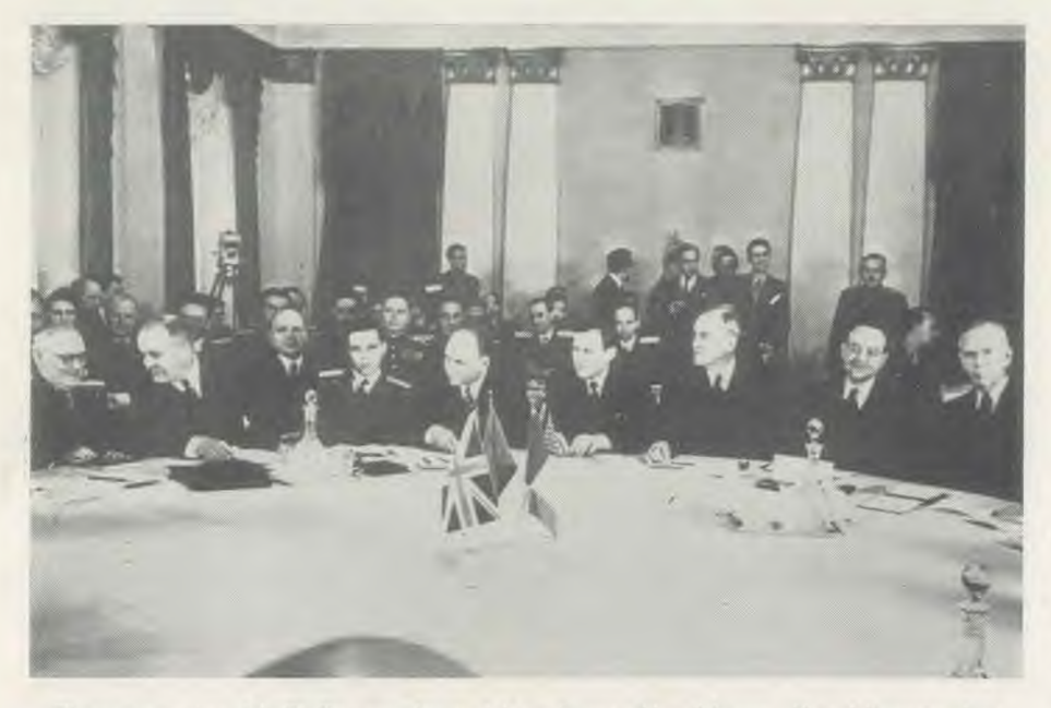
The representatives of the Big Four seated around the conference table at Moscow. Heated discussions have ensued, but little has been accomplished in establishing world peace.

SINCE Mr. Churchill made his great plea for the ending of the "tragedy of Europe" by building "a kind of United States of Europe," many influential voices have been upraised in support of the proposal.