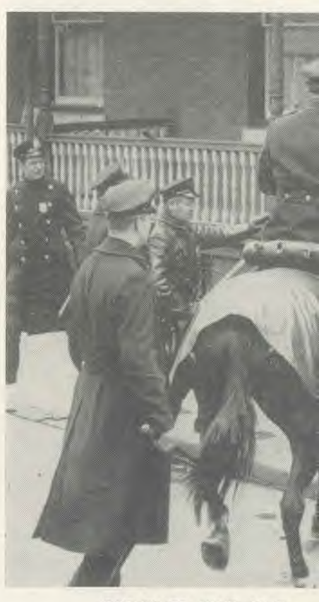
OUR TIMES, JUNE, 1947