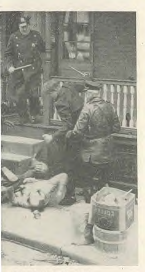
A hatless policeman stands over a fallen picket-line parader at the strikebound General Electric plant in Philadelphia, Pa. The Devil is happy about situations like this.

These names and titles are sufficient to prove the existence of the devil to anyone who scans the record. However, the personality of Satan is still further spread on the record by statements which represent this chief of the kingdom of evil, malice, and crime as presumptuous (Job 1:6; Matthew 4: 5, 6), proud (1 Timothy 3: 6), powerful (Ephesians 2: 2; 6: 12), wicked (1 John 3:12), malignant (Job 1:9; 2:4), subtle (Genesis 3: 1; 2 Corinthians 11: 3), deceitful (2 Corinthians 11: 14; Ephesians 6: 11), fierce (Luke 8: 29; 9: 39, 42), cruel (1 Peter 5: 8), always active in promoting evil (Job 1:7; 2:2). These are all attributes of personality.