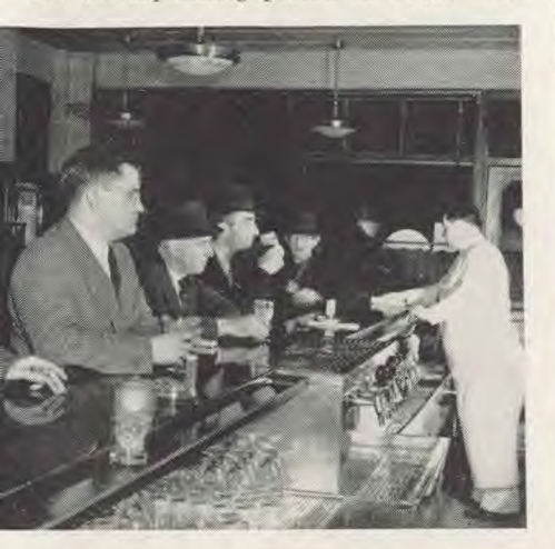
Places like this make good breeding spots for crime.

Right now our nation is involved in the bloodiest crime wave in its history. Federal Bureau of Investigation figures show that for the first six months of 1946 crime had increased thirteen per cent over the corresponding period of 1945. The