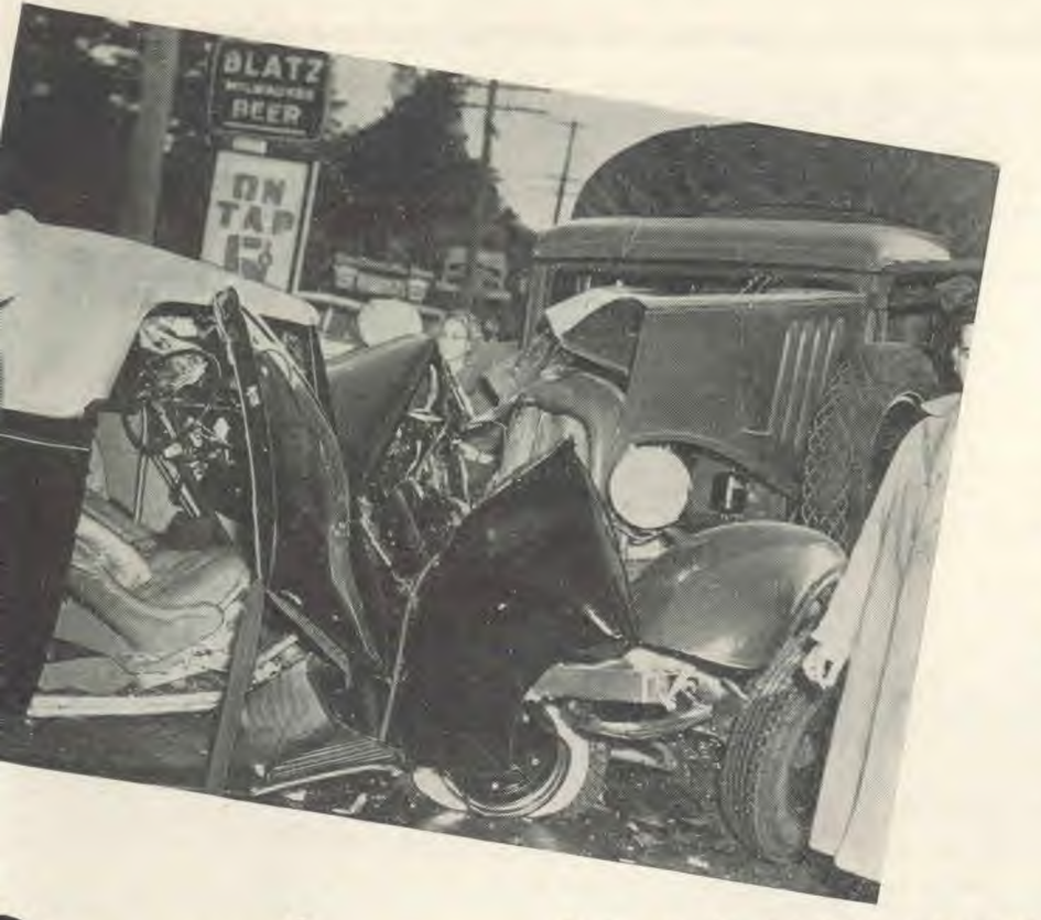
Another victim of the alcohol habit meets his end right next to a sign advertising the potent drink that settled his doom. This sight probably gave great satisfaction to the Devil.