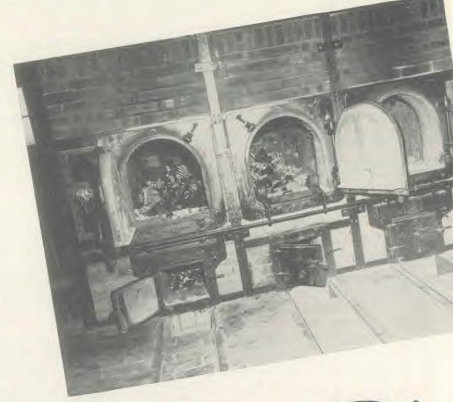
The mass-murder ovens of Weimar, Germany, give evidence of the unrestrained lust to kill that has developed in our so-called enlightened civilization. Satan must have been pleased with this atrocious crime.

In order to identify the archcriminal of the spiritual world there is a combined Scotland Yard and F.B.I. which may be consulted. His machinations are there recorded. His identity is there precisely pointed out. You will find it in a Book