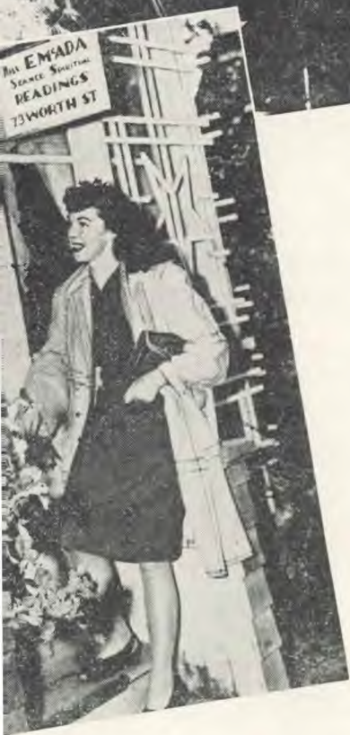
Two noted Spiritualists (left) Sir Arthur Conan Doyle and (right) Sir Oliver Lodge. (Above) A blindfolded Spiritualist giving messages in a Spiritualist meeting, and (below) a young lady chatting with a Spiritualist medium who is supposed to be able to bring back the spirits of the dead.

writer in the Bible who makes use of the words "immortal" and "immortality." He never applies either term to the righteous or the wicked in this world nor to the soul before or after death. He uses the word "immortal" as an attribute of the King Eternal. (1 Timothy 1:17.) He