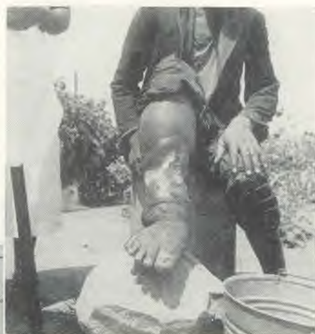
(Above) A case of elephantiasis and tropical ulcer under treatment at a mission clinic in Africa.