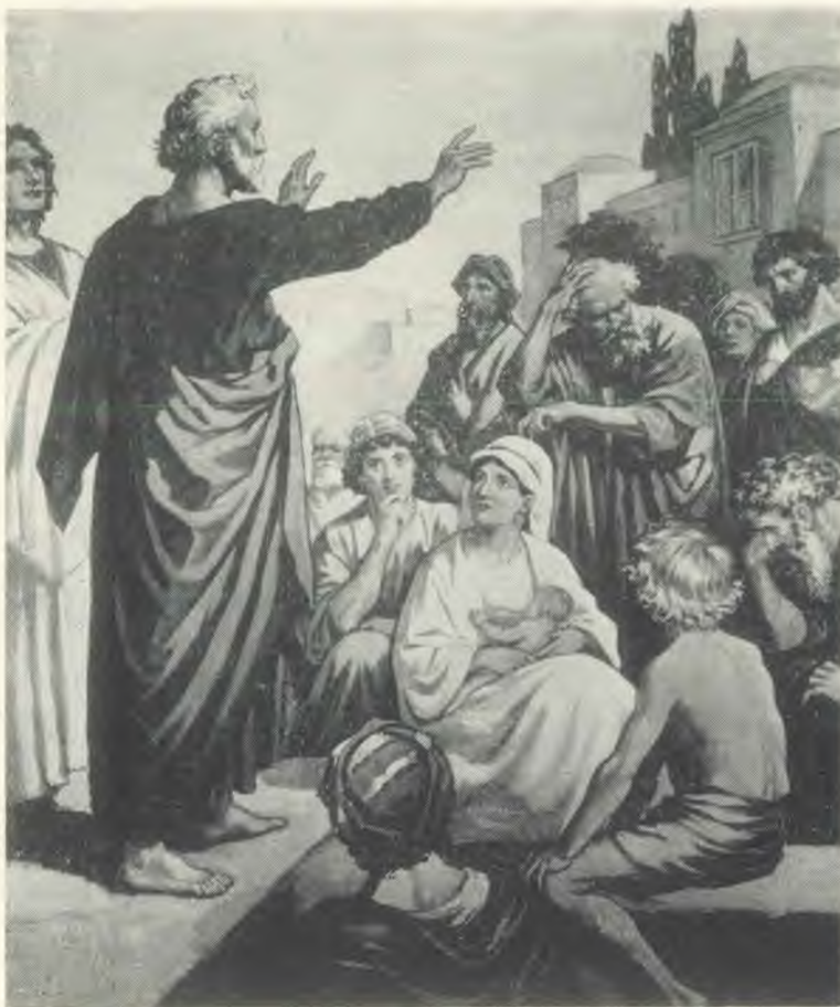
The New Testament reveals that the apostles were faithful in keeping the Sabbath day holy, and the Book of Acts records eighty-four Sabbath meetings that they attended.

T HROUGHOUT His entire life ministry upon earth, Christ honored and kept the seventh-day Sabbath; and His disciples and apostles ever followed the Sabbath-keeping example of their divine Lord. The record of the crucifixion states: