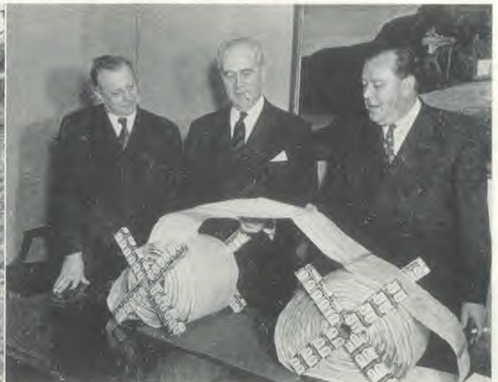
This huge scroll, containing 200,000 American names pledging loyal support for peace, was recently presented to the United Nations.

With the grain belt of the United States holding the key to the world's food supply, tremendous interest will be attracted to it in the months ahead. A prolonged drought could bring severe government controls back that would probably be more drastic than those imposed during the war. A major crop failure in this day of critical food short-