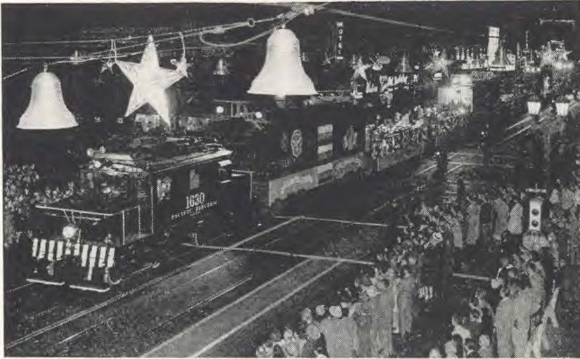
The starting of the Friendship Train in Hollywood, California, marked the beginning of a magnanimous project.