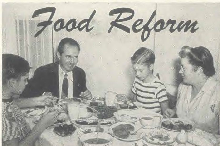
A wholesome diet of foods that are not highly seasoned and irritating will protect against stimulating a craving for strong drink.

There are those in whom this craving exists, who, because of early training and a good supply of will power, are able to keep away from drink. There are those, however, with weakened wills, who escape just as long as they are unconscious of what they crave. Should they ever take a drink of liquor, this desire would be met. Having made this discovery, in all probability they would resort to this means of allaying it again and again. This explains how the 750,000 chronic alcoholics we have in the United States were made.