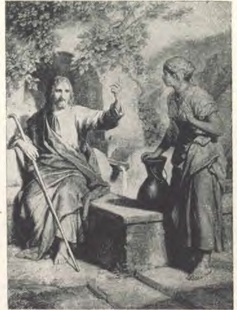
The water of life that Christ offered to the Samaritan woman at the well is freely offered to all who will partake of it.

So also is it on life's great battlefield, where souls are wounded and dying from the fearful effects of sin. They are thirsty for the water of life, with none to reach out to them the refreshing draft