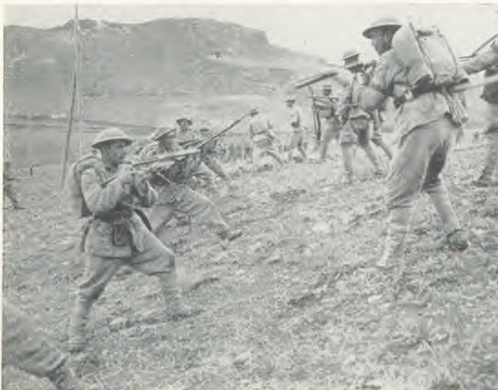
The preparation of Turkey's army for any eventuality characterizes the unrest that permeates the world, and particularly the Near East.

The president said that "we cannot hope to be worthy of the continued blessing of Providence if our prosperity is used selfishly for our own personal gratification."— The New York Times , November 17, 1947. The president also noted that "regular tax payments through withholding provisions had given 40,000,000 wage earners an 'ease in payment' of exactions running to two, three, and more times that of the Biblical tithe."— Ibid.